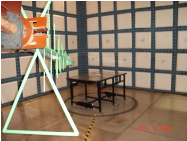
Test Set-up for Radiated Emissions Vertical Polarity