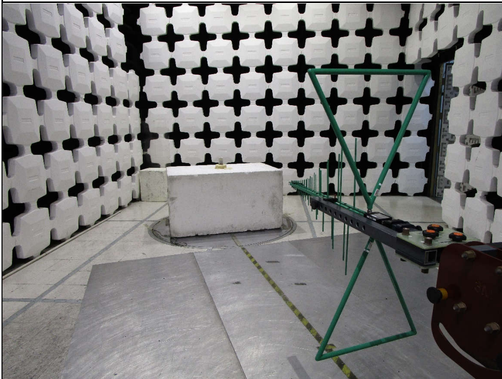
Test Setup for Spurious Radiated Emissions, 30-1000MHz – Antenna Polarization Vertical