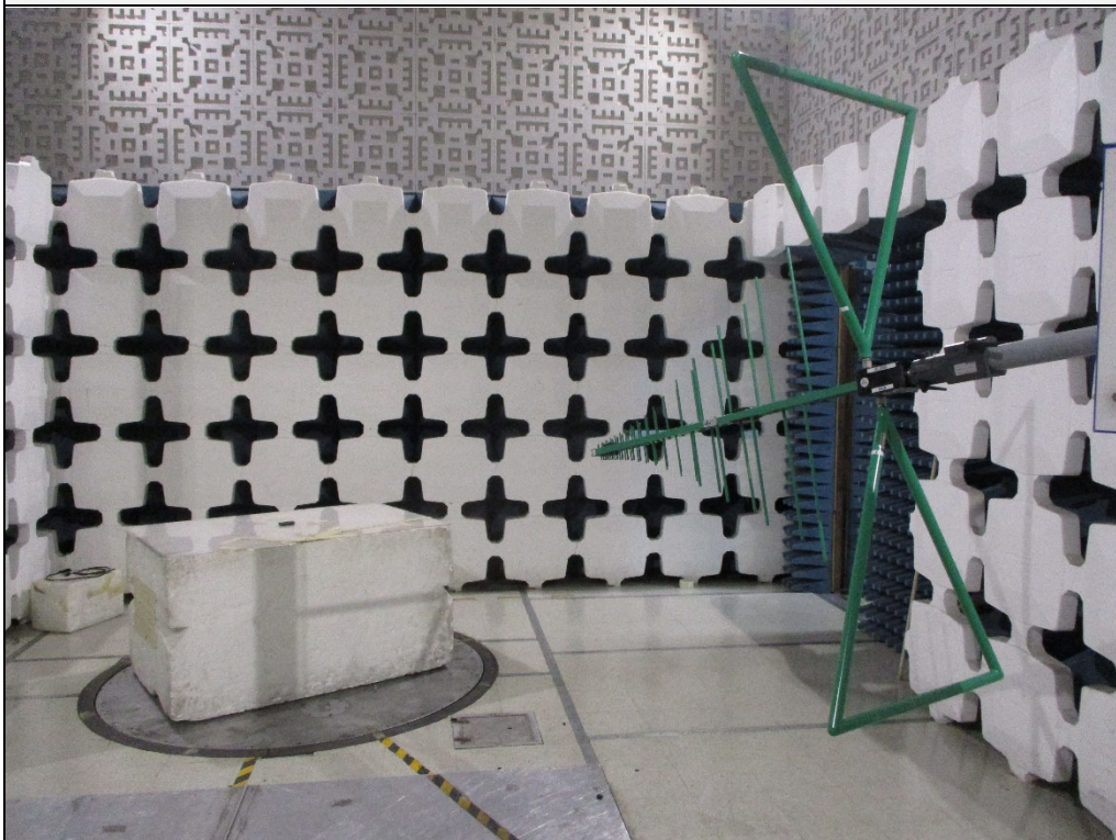
Test Setup for Spurious Radiated Emissions, 30-1000MHz – Antenna Polarization Vertical