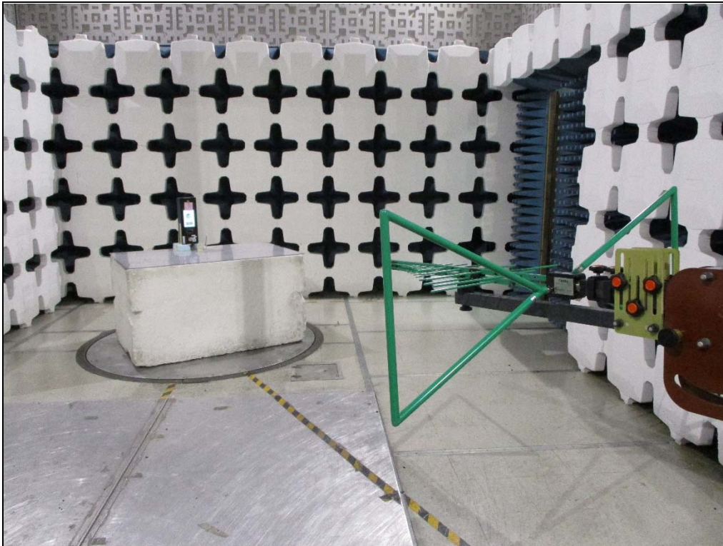
Test Setup for Spurious Radiated Emissions, 30-1000MHz – Antenna Polarization Horizontal