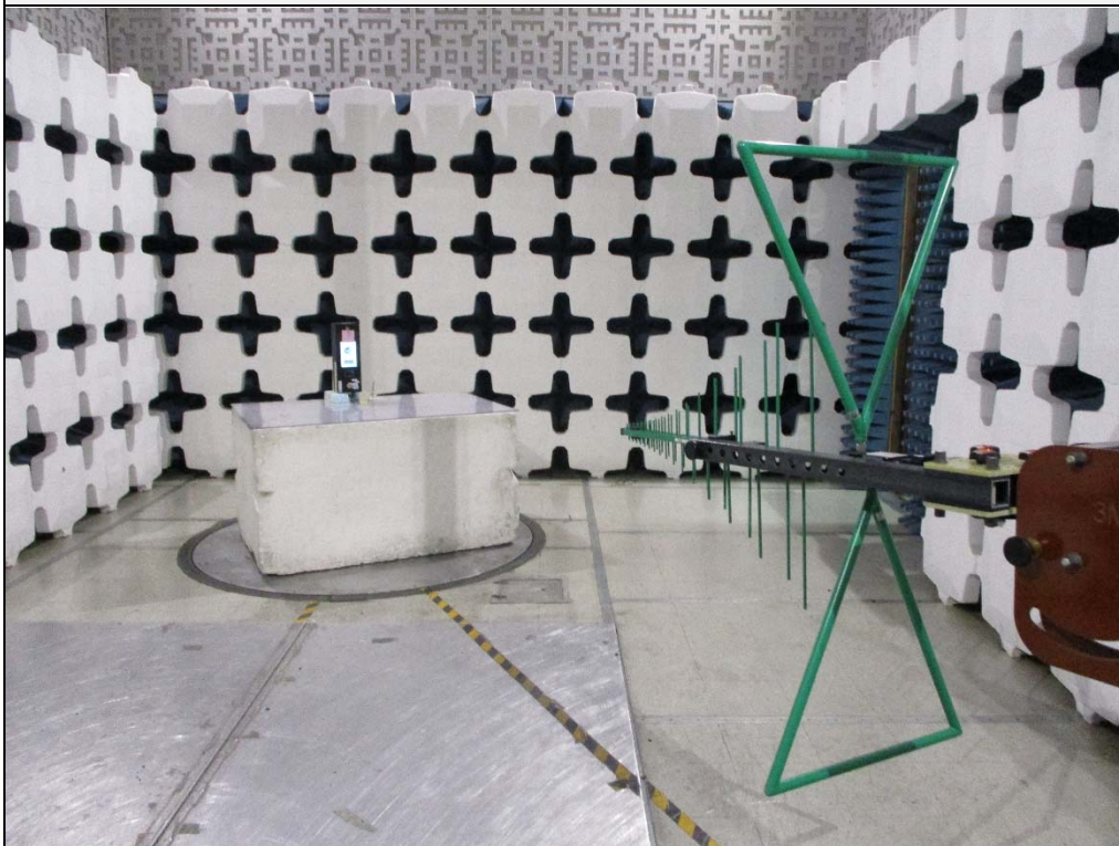
Test Setup for Spurious Radiated Emissions, 30-1000MHz – Antenna Polarization Vertical