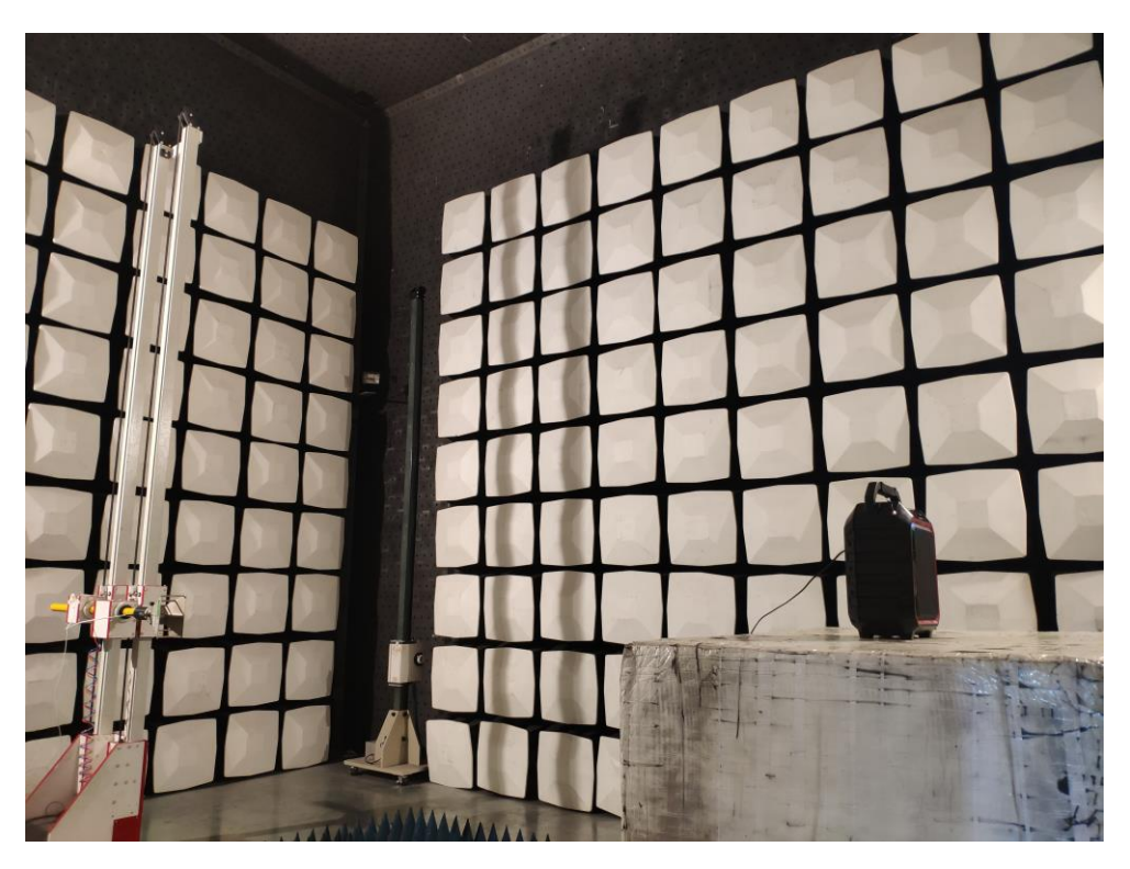
Radiated Emission Above 1G