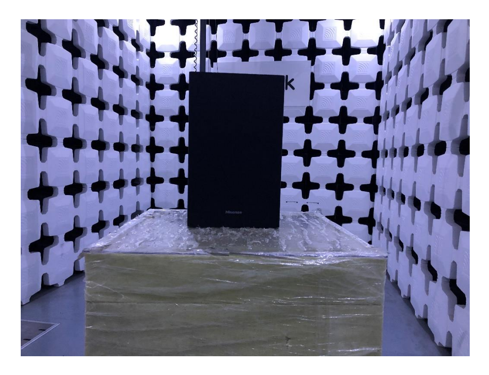
Back View (Above 1GHz)