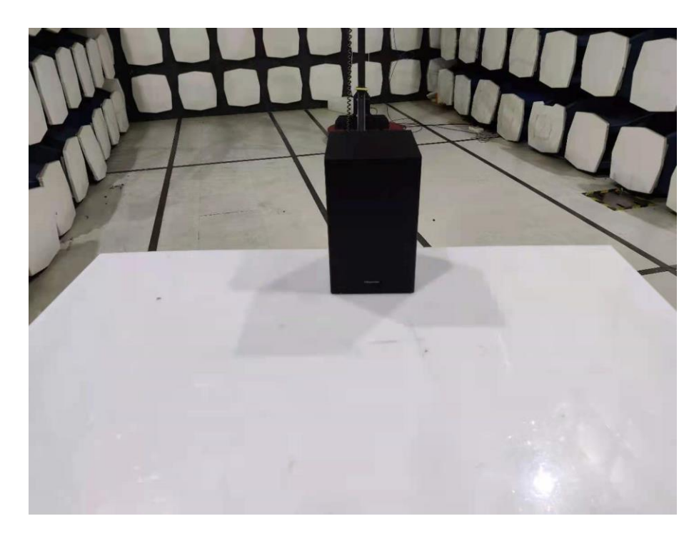
Back View (Below 1GHz)