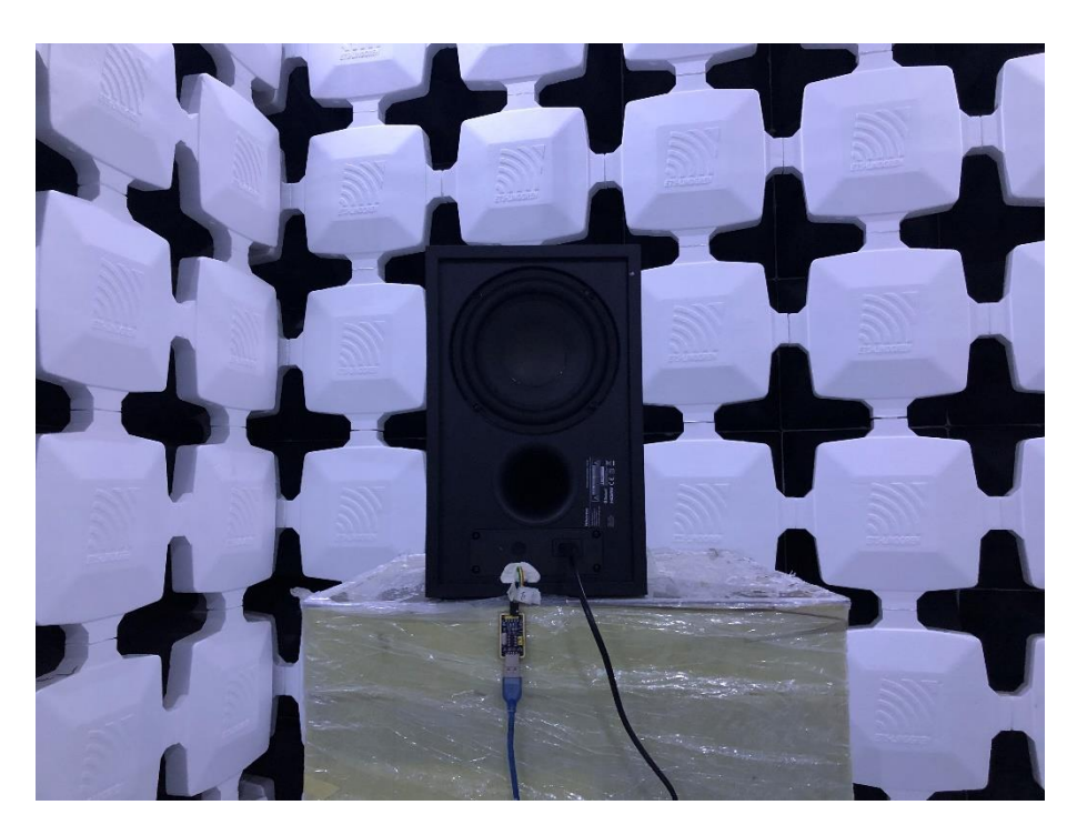
The EUT is placed at the center of turntable