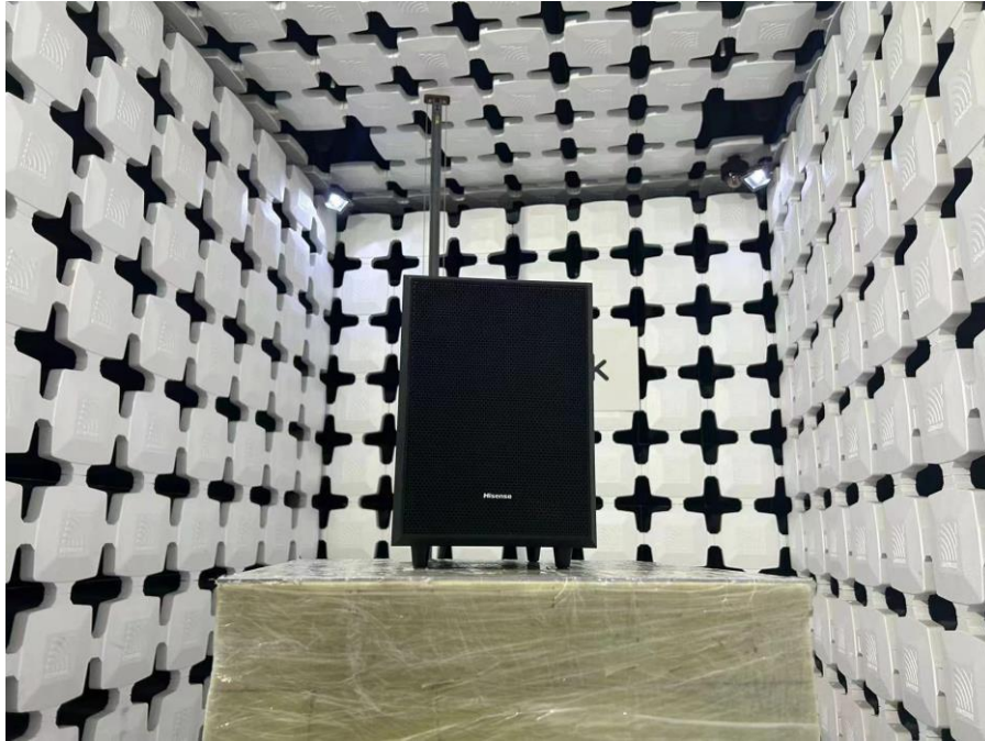
Back View (Above 1GHz)