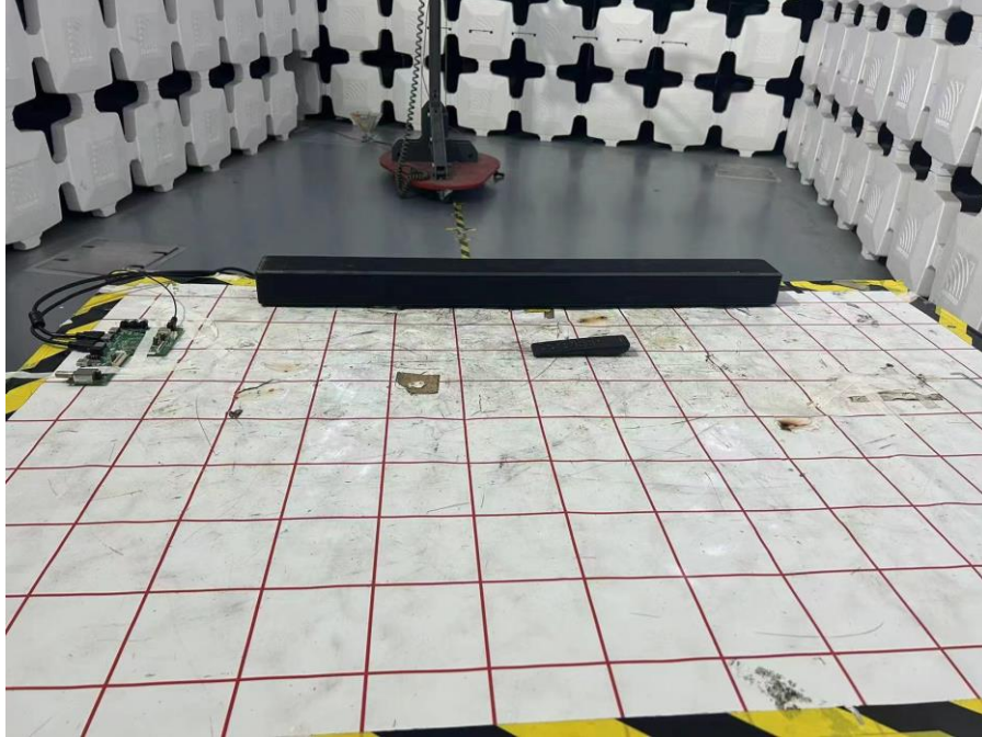
Back View (Below 1GHz)