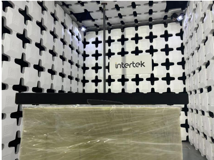
Back View (Above 1GHz)