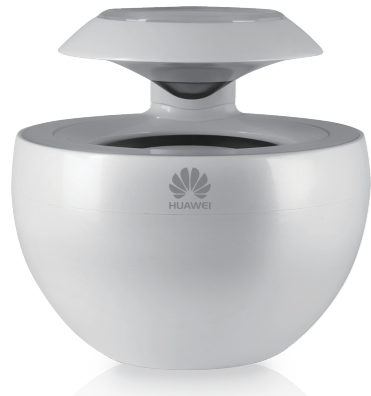
SWAN User Guide HUAWEI Bluetooth Speaker