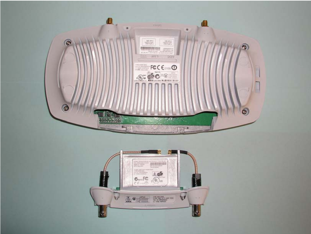
Photo 2; WSAP5030 External Antenna connections 2.4GHz module un-iinstalled