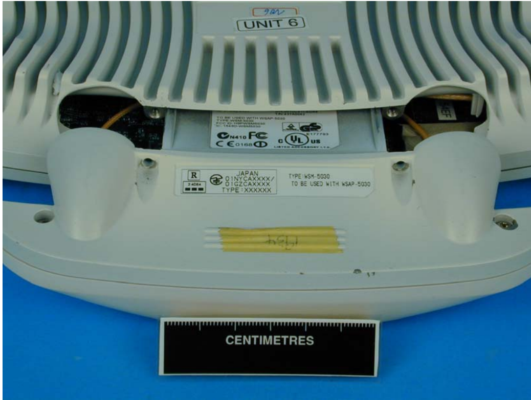
Photo 4: WSM5030 2.4GHz Integral Antenna Outside Case Rear Showing Connection to WSAP5030