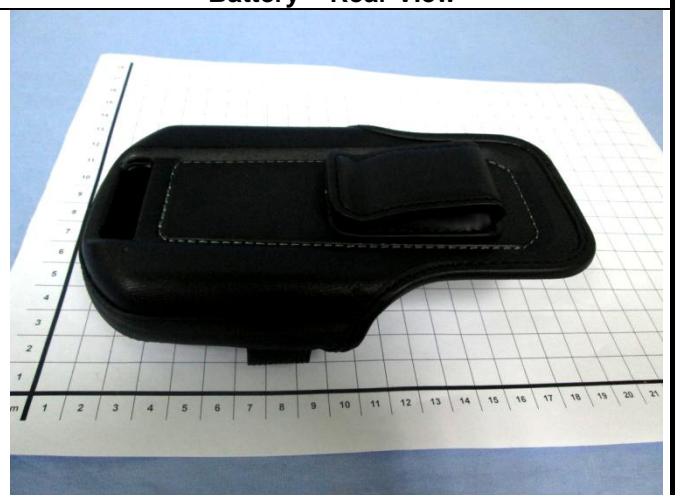
Holster – Rear View