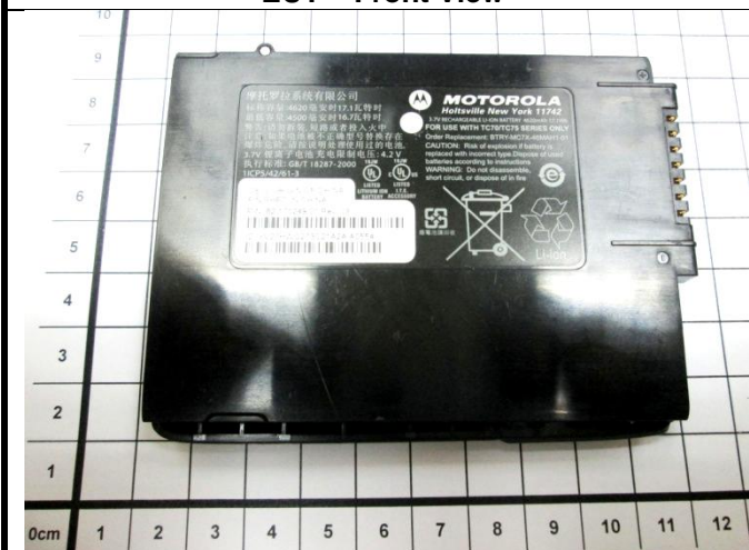
Battery – Front View