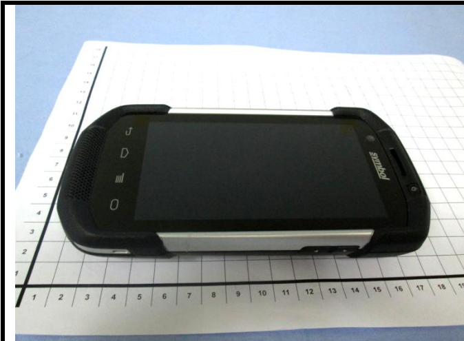
EUT – Front View