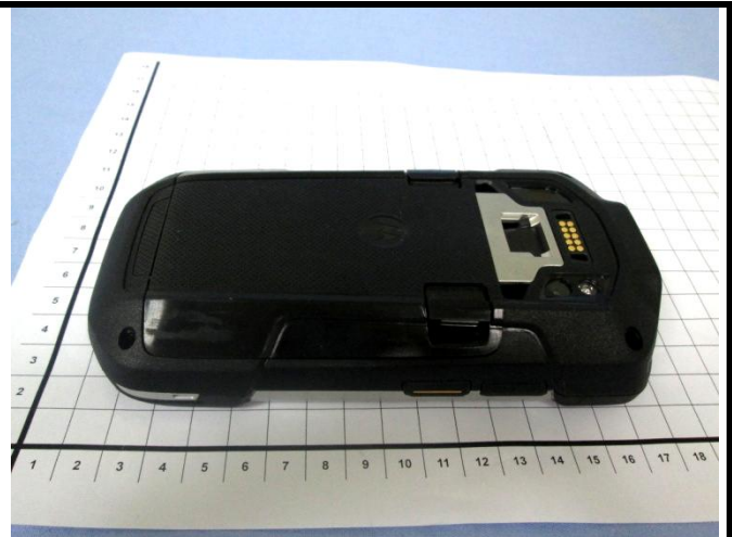
EUT – Rear View