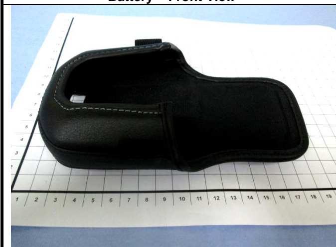
Holster – Front View