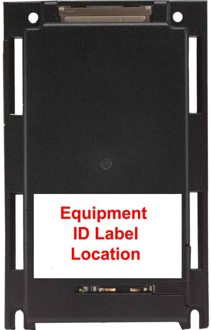
Typical Housed Unit (Top View Showing ID Label )