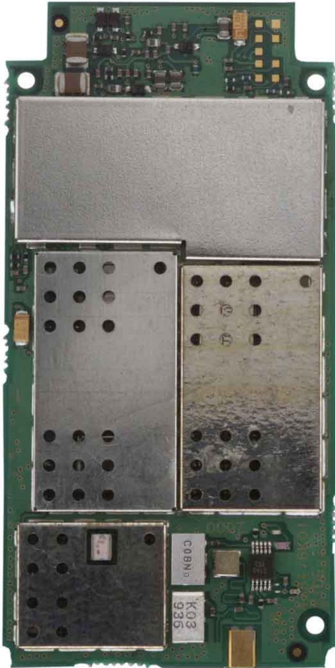
Typical Non-Housed Unit (Bottom View)