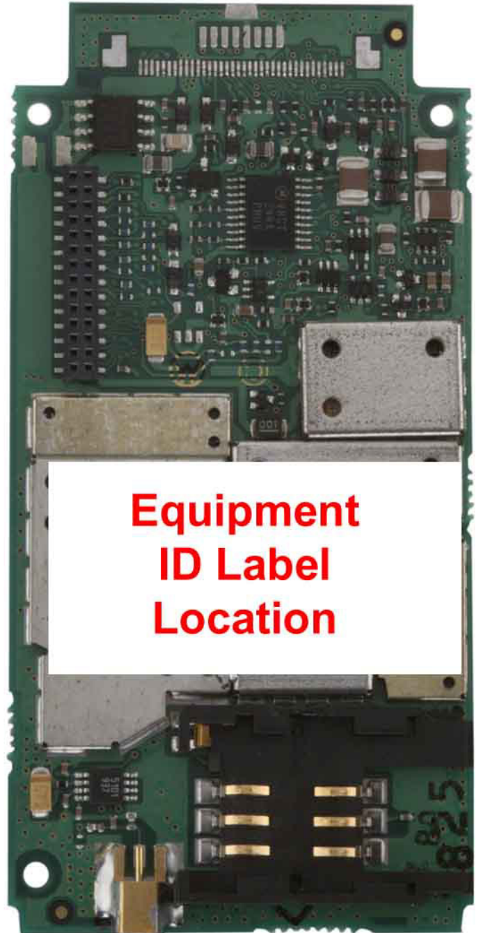
Typical Non-Housed Unit (Top View Showing ID Label on Shields)