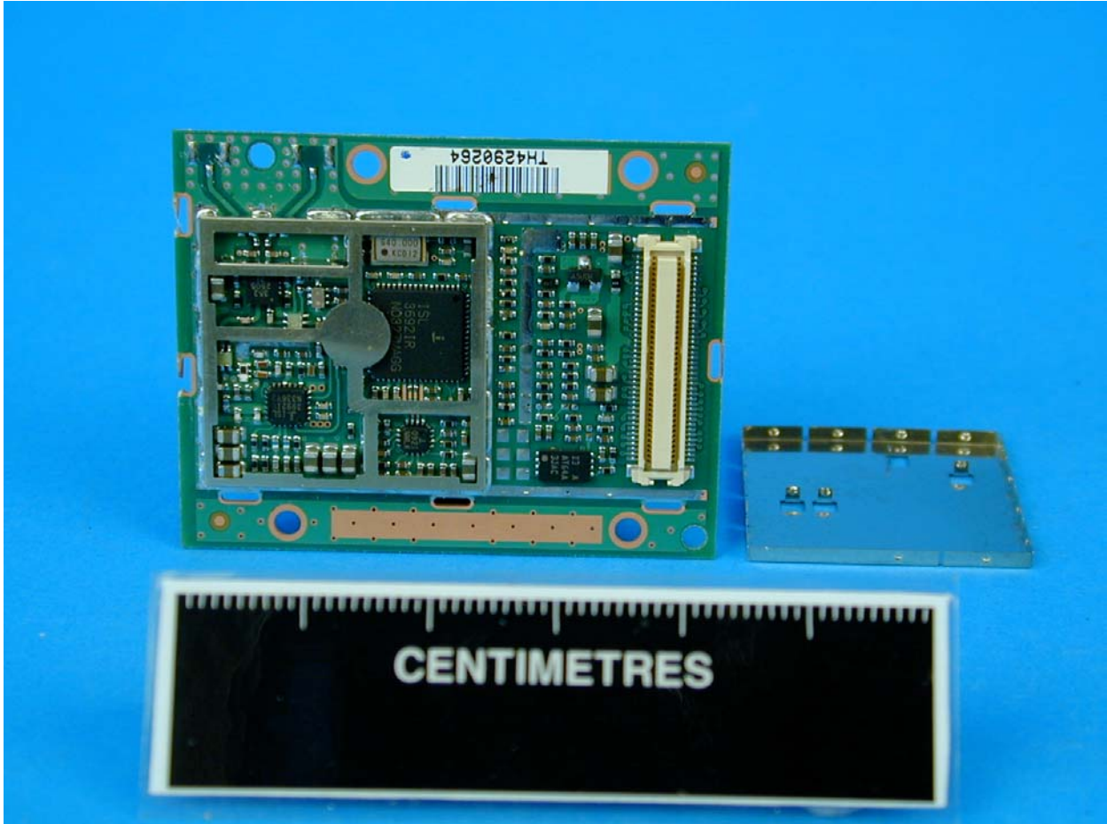
Internal View 2 21-21160-01