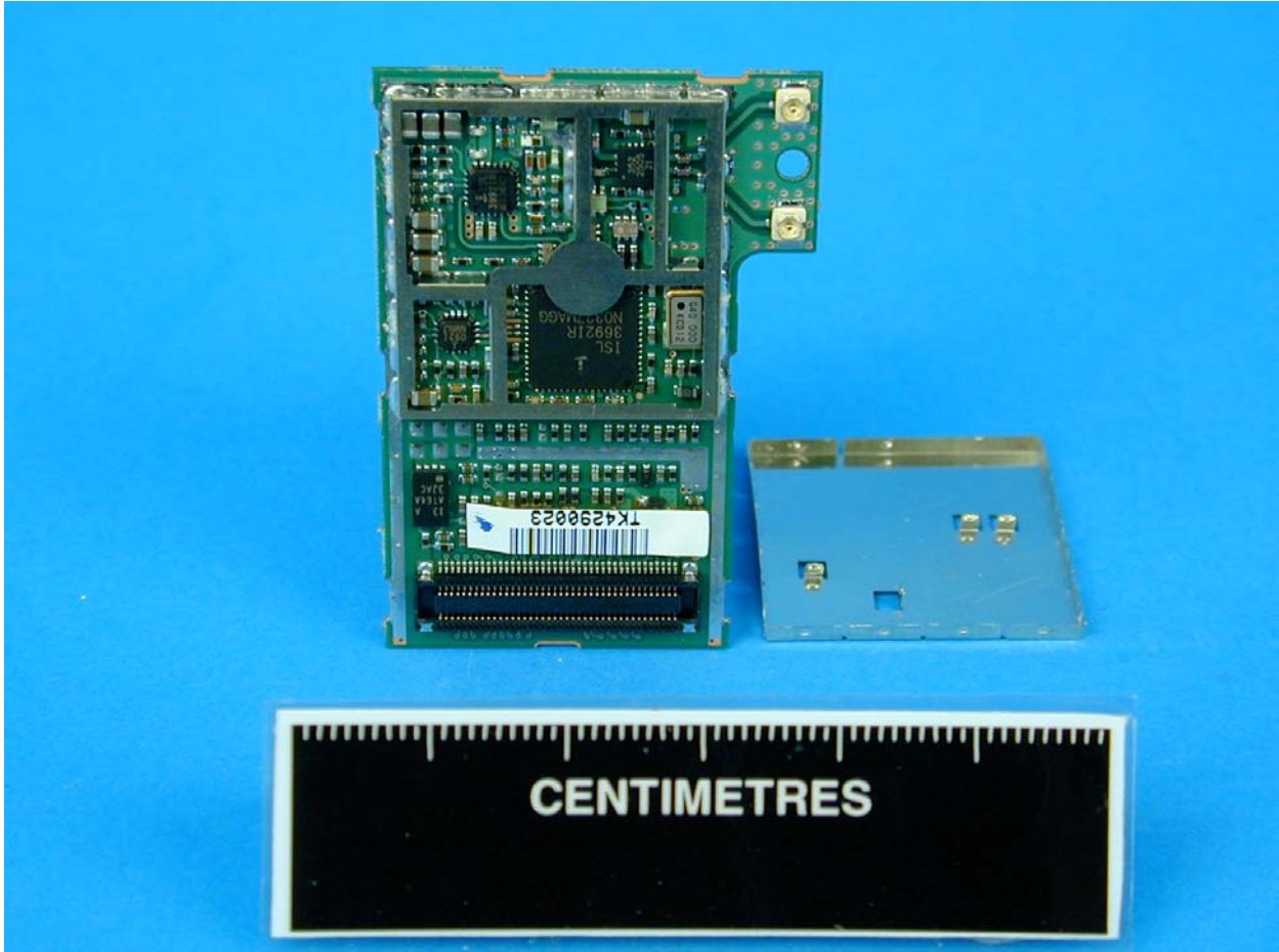
Internal View 3 21-21160-02