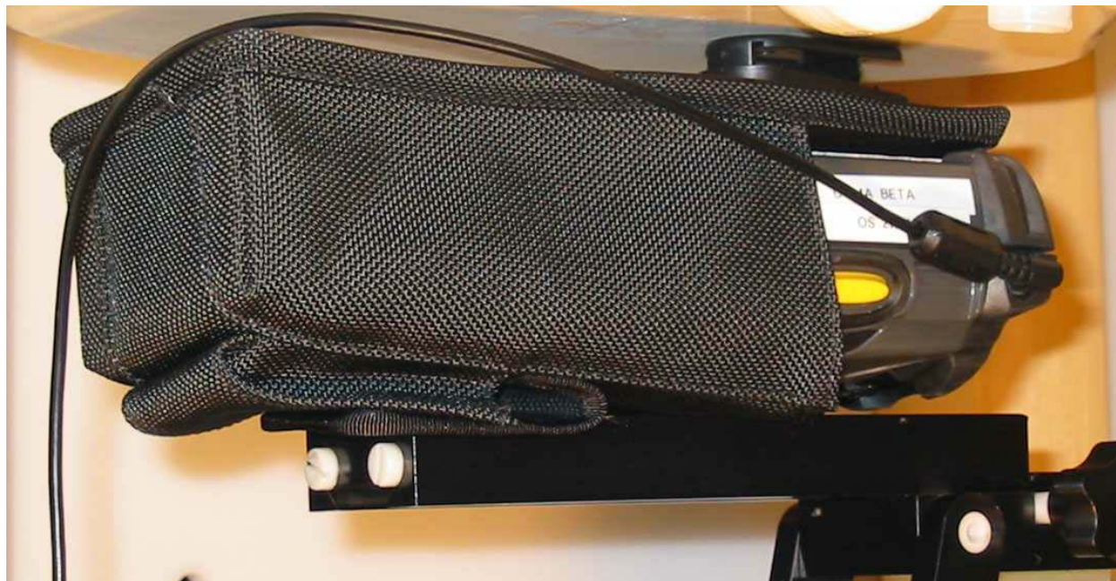
Figure 6 – MC9063 Screen In