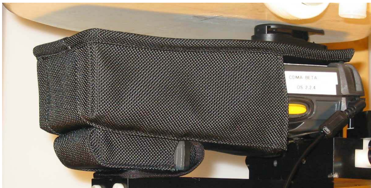
Figure 7 – MC9063 Screen In Extra Battery