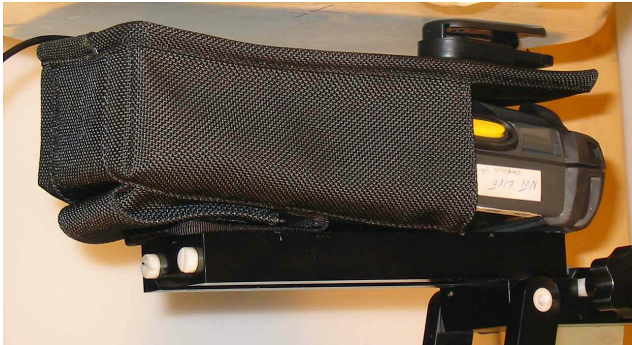
Figure 8 – MC9063 Screen Out

Symbol Technologies, Model No: MC9063 FCC ID: H9PMC9063B