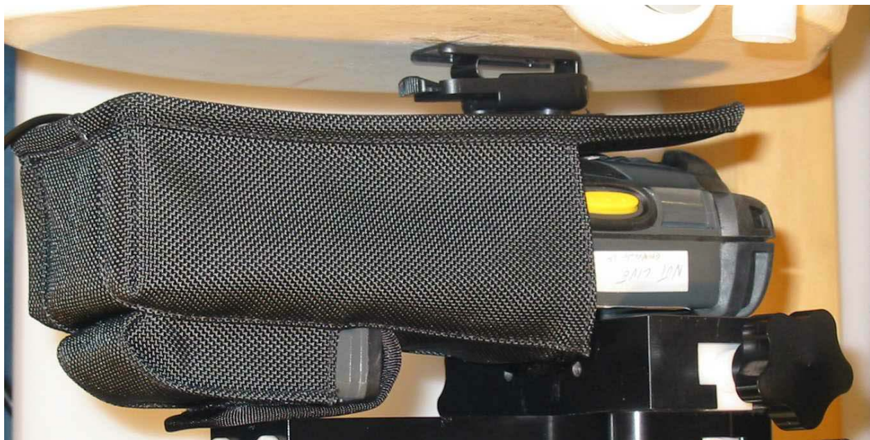
Figure 9 – MC9063 Screen Out Extra Battery