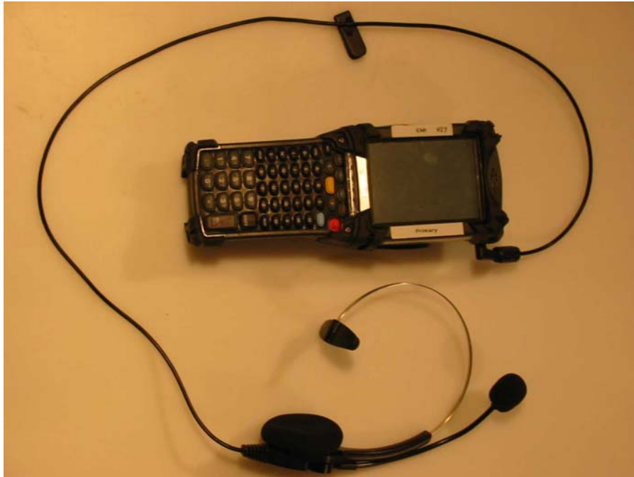
Figure 2 – MC9063 (Front) with headphones