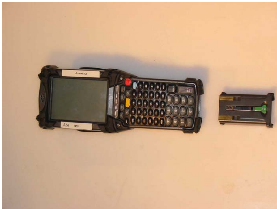
Figure 4 – MC9063 with Battery Removed

Symbol Technologies, Model No: MC9063 FCC ID: H9PMC9063B