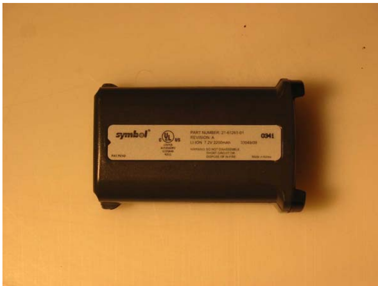
Figure 5 – Battery