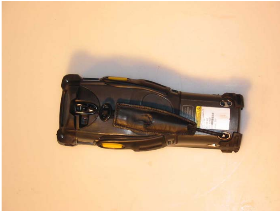
Figure 3 – MC9063 (Back)