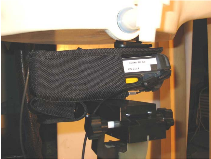
Figure 6 – MC9063 Screen In