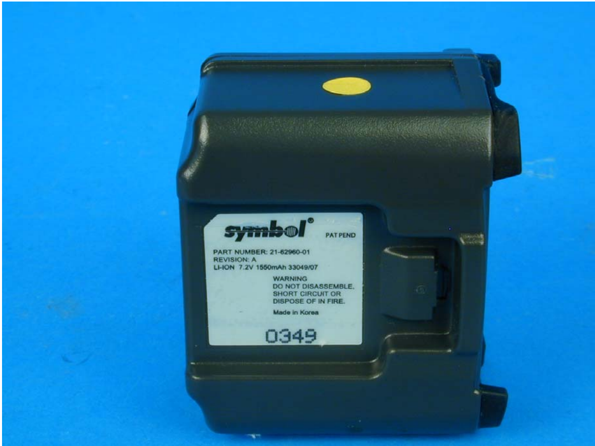
Battery Label View