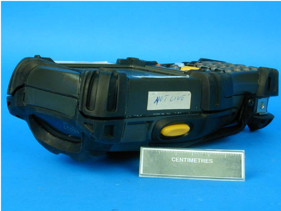
Left Hand Side View