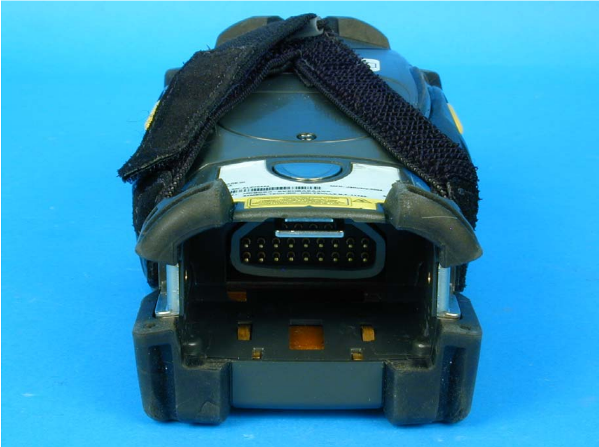
Base View without Battery