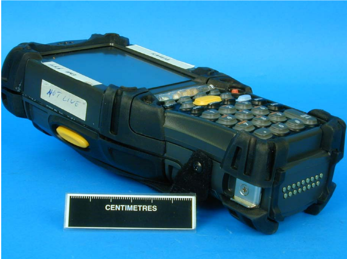
Right Hand Side View