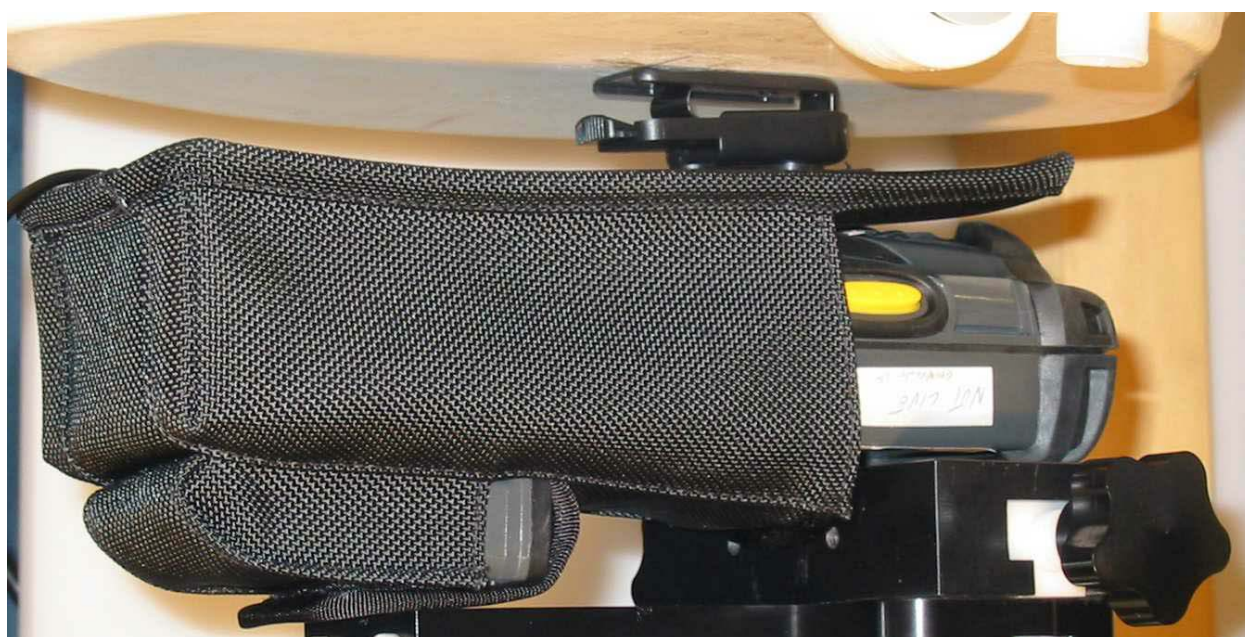
Figure 9 – MC9063 Screen Out Extra Battery