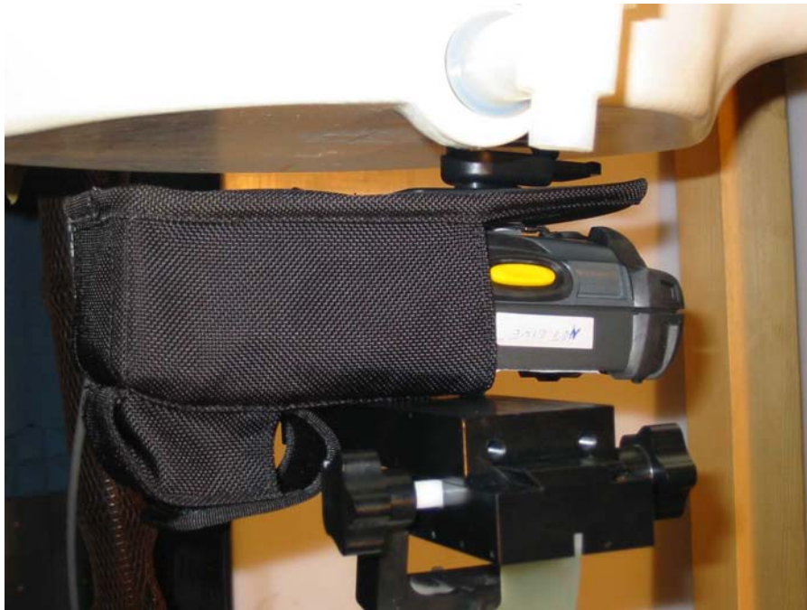
Figure 8 – MC9063 Screen Out

Symbol Technologies, Model No: MC9063 FCC ID: H9PMC9063B