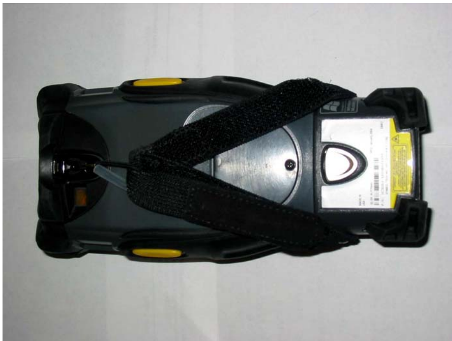
Figure 3 – MC9063 (Back)