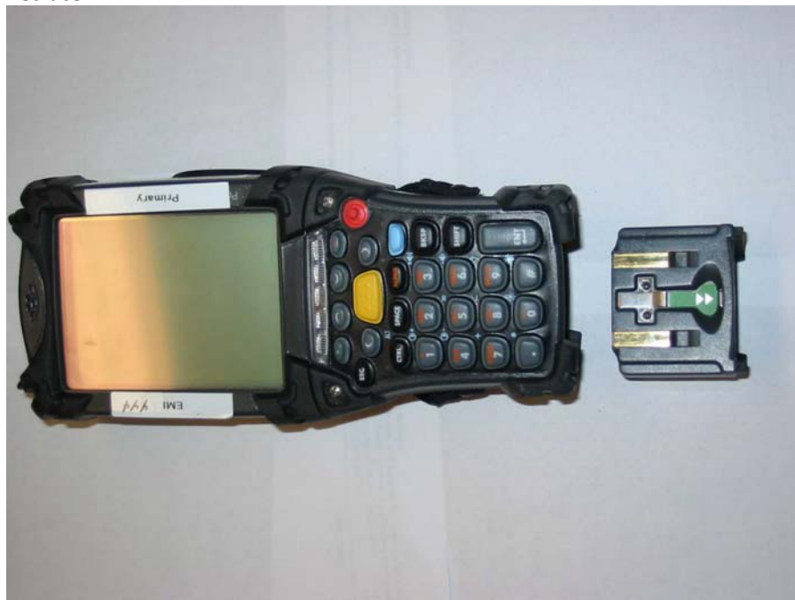
Figure 4 – MC9063 with Battery Removed

Symbol Technologies, Model No: MC9063 FCC ID: H9PMC9063B