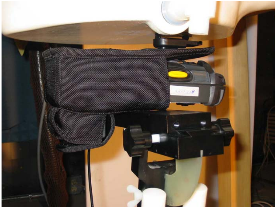
Figure 9 – MC9063 Screen Out Extra Battery