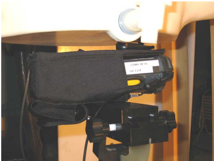
Figure 6 – MC9063 Screen In