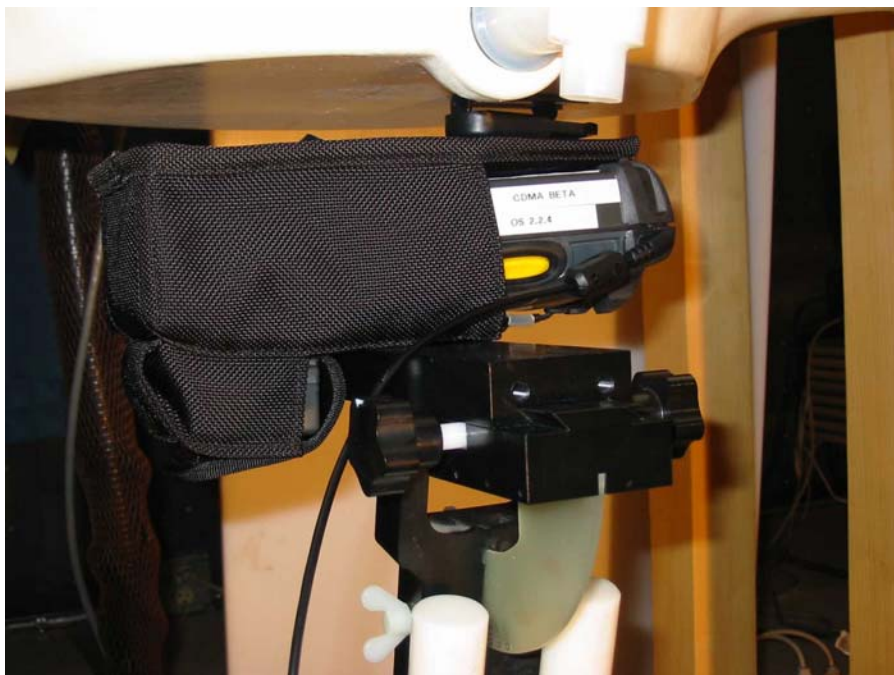
Figure 7 – MC9063 Screen In Extra Battery