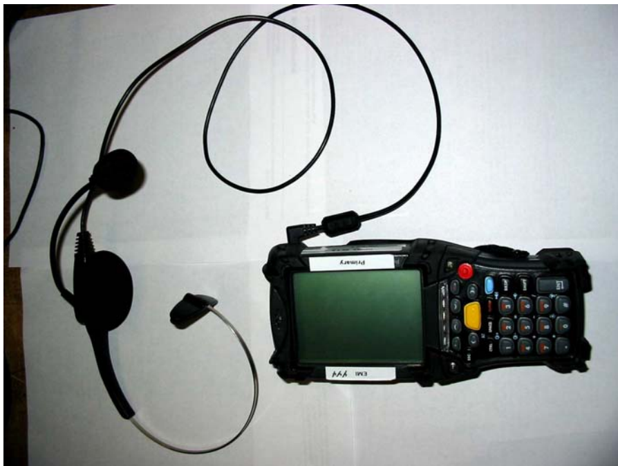
Figure 2 – MC9063 (Front) with headphones