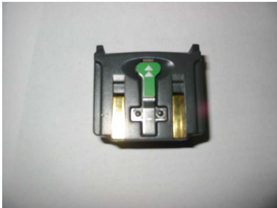
Figure 5 – Battery