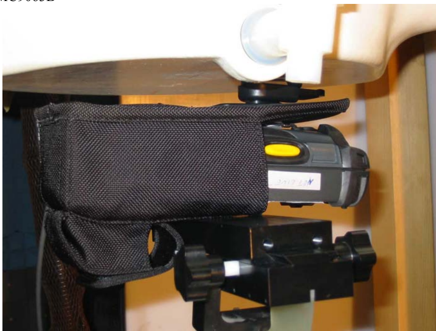
Figure 8 – MC9063 Screen Out

Symbol Technologies, Model No: MC9063 FCC ID: H9PMC9063B