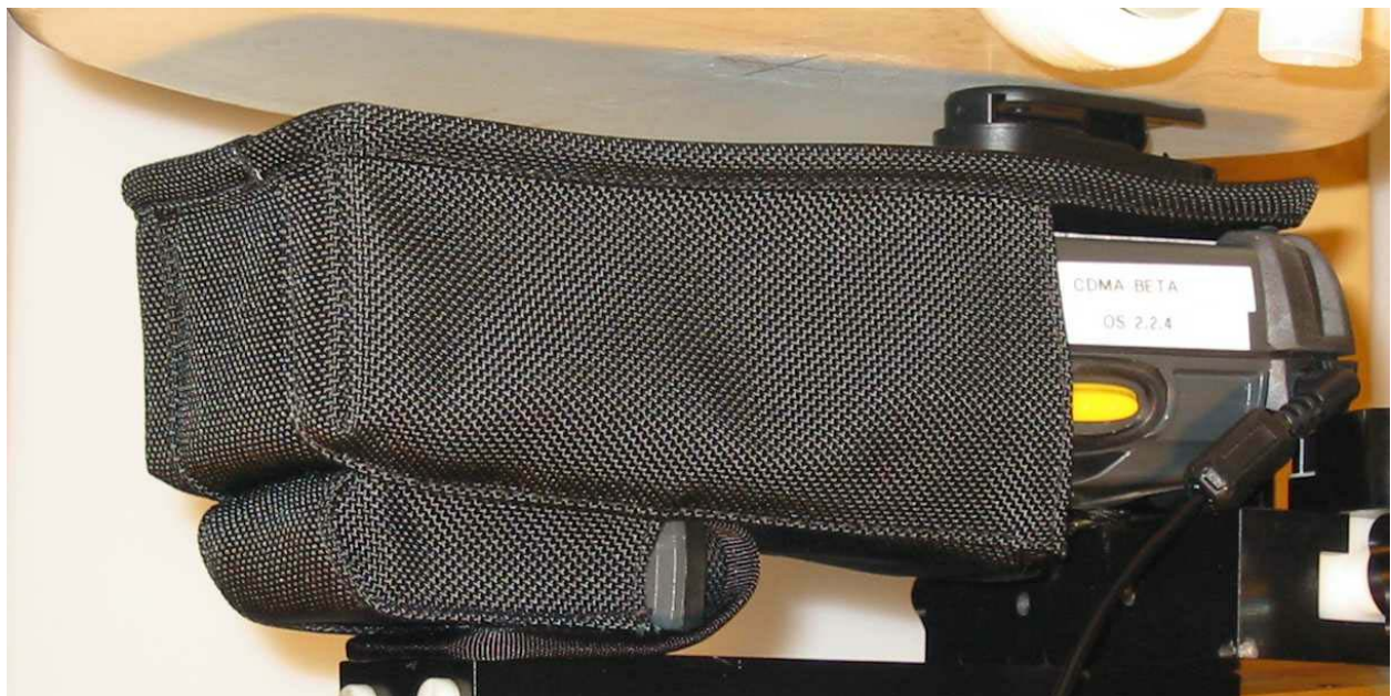
Figure 7 – MC9063 Screen In Extra Battery