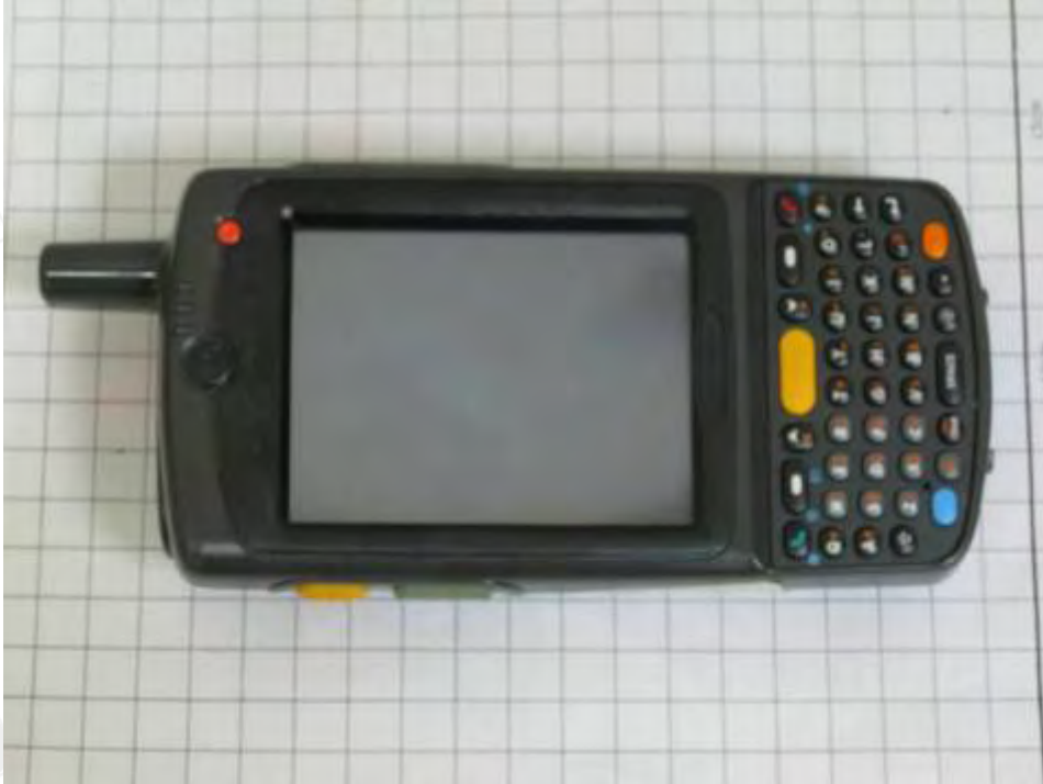
Fig.3 Front view of device