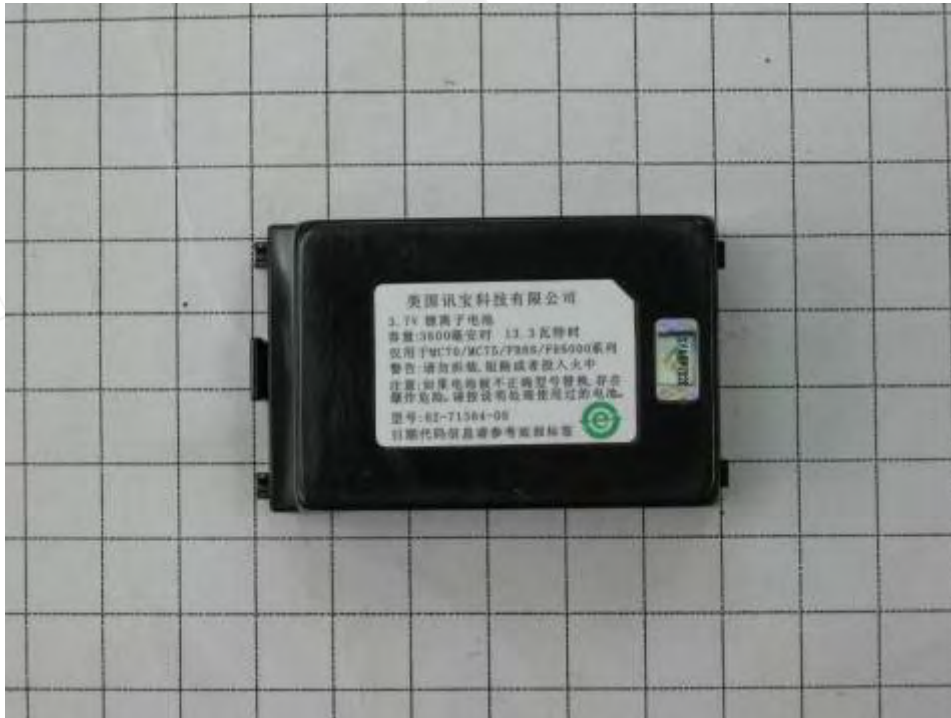
Fig.5 Front view of Battery