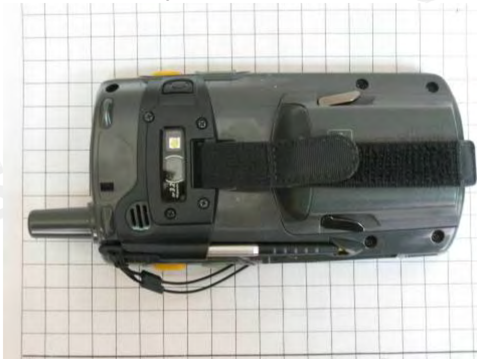
Fig.4 Back view of device

Unless otherwise stated the results shown in this test report refer only to the sample(s) tested and such sample(s) are retained for 90 days only. 除非另有說明，此報告結果僅對測試之樣品負責，同時此樣品僅保留90天。本報告未經本公司書面許可，不可部份複製。