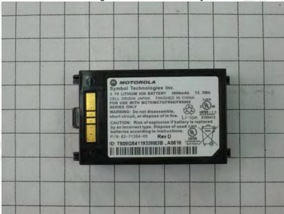
Fig.6 Back view of Battery