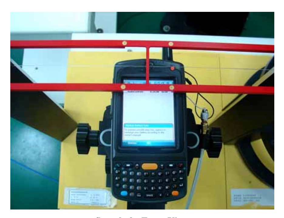
Sample 2 - Front View