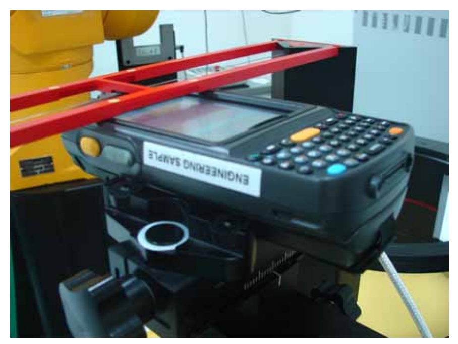
Sample 2 - Side View

©2008 SPORTON INTERNATIONAL INC. SAR/HAC Testing Lab This report shall not be reproduced except in full, without the written approval of Sporton. FCC ID: H9PMC7508 n. Report Version : Rev.03 Report Issued Date : Oct. 09, 2008