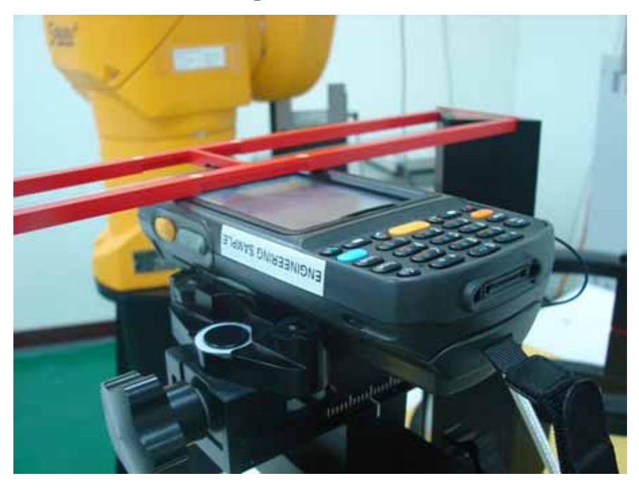
Sample 1 - Side View

This report shall not be reproduced except in full, without the written approval of Sporton. Report Version: Rev.03 FCC ID: H9PMC7508 Report Issued Date: Oct. 09, 2008