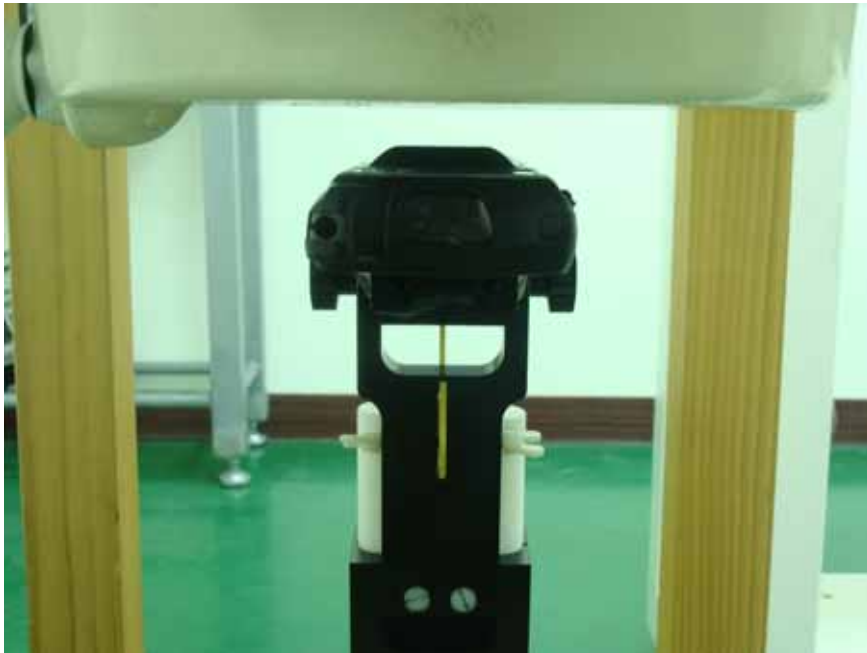
EUT Bottom with 1.5cm Gap (Sample 2)