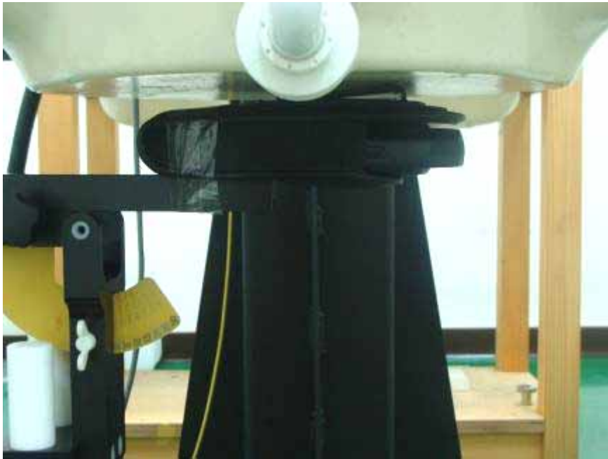
EUT Bottom with 0cm Gap (Sample 1 with Holster 3)