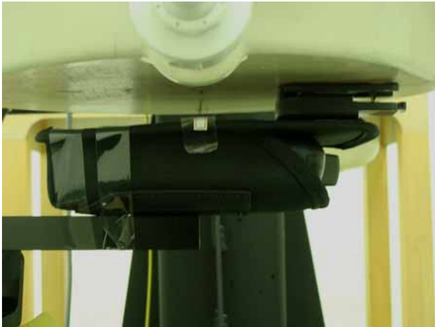
EUT Face with 0cm Gap (Sample 2 with Holster 1)