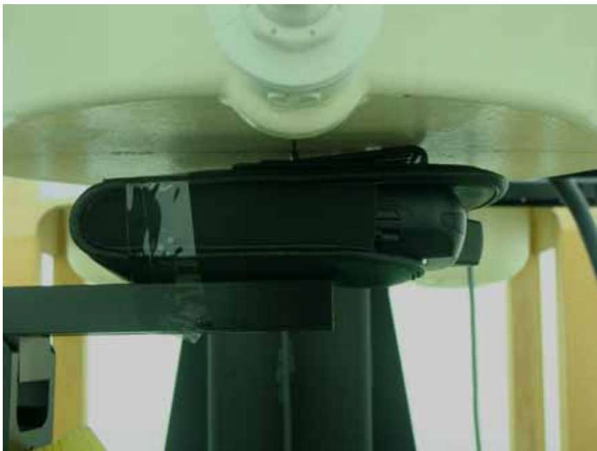
EUT Face with 0cm Gap (Sample 2 with Holster 3)