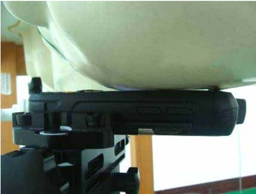
Left Cheek (Sample 1)