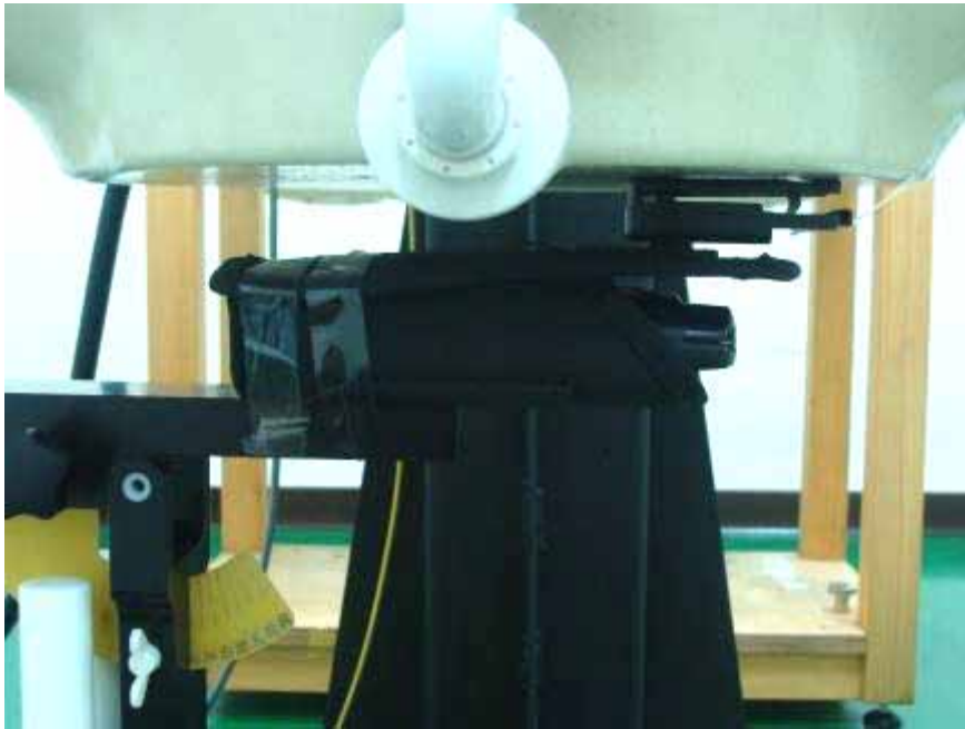
EUT Bottom with 0cm Gap (Sample 2 with Holster 1)