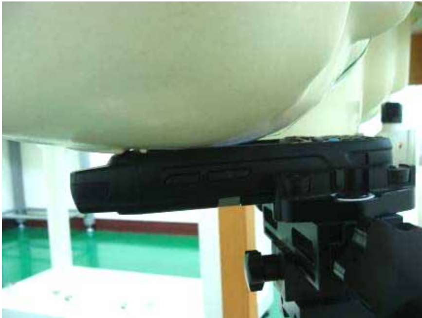
Right Cheek (Sample 1)