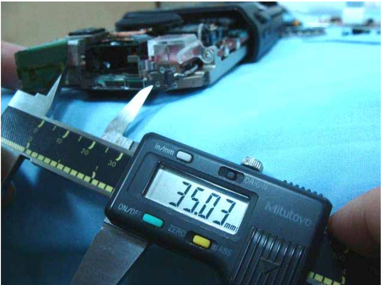
(WWAN Ant. to WLAN Ant.)