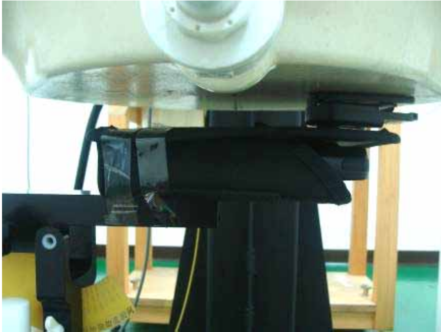
EUT Bottom with 0cm Gap (Sample 1 with Holster 1)