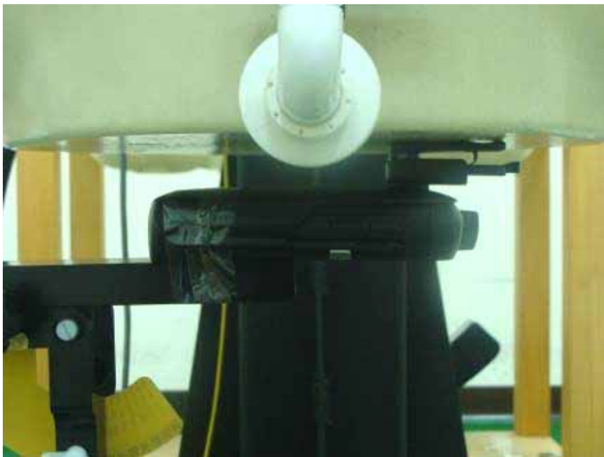
EUT Face with 0cm Gap (Sample 1 with Holster 2)