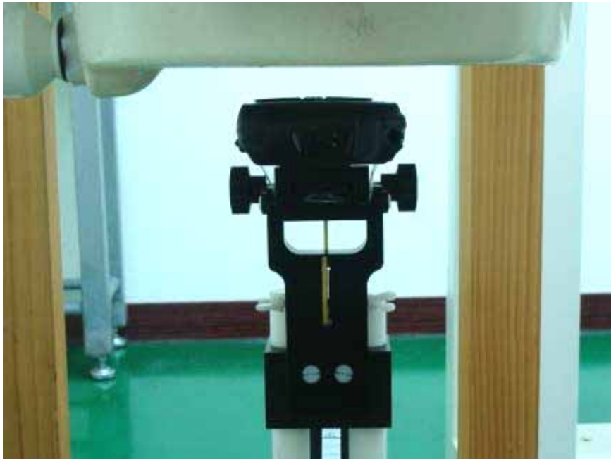
EUT Face with 1.5cm Gap (Sample 2)