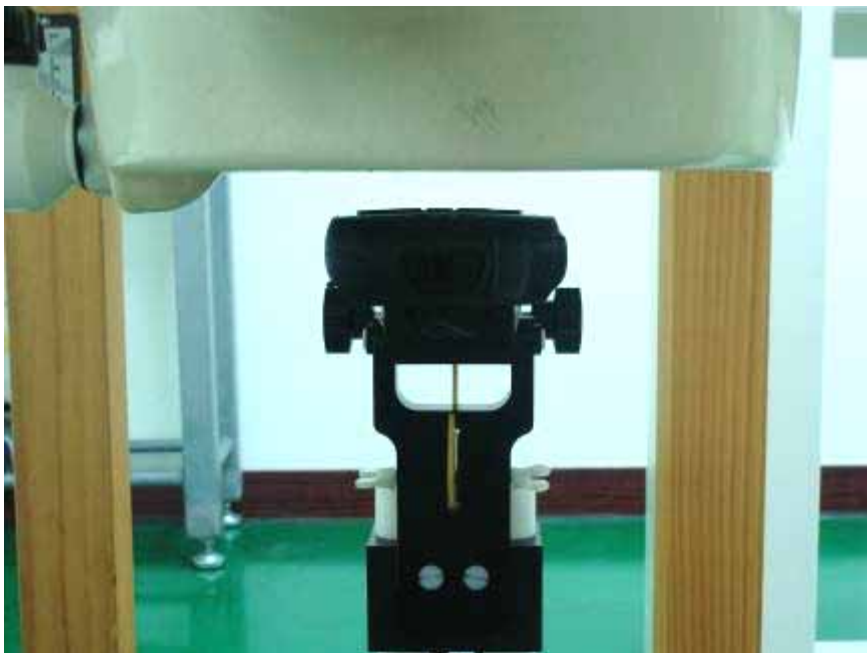
EUT Face with 1.5cm Gap (Sample 1)