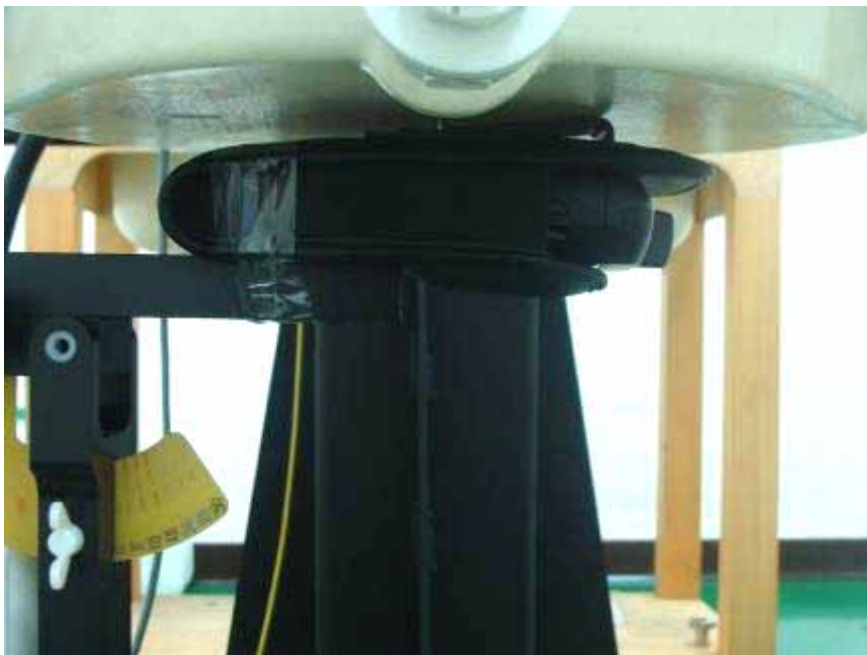
EUT Face with 0cm Gap (Sample 1 with Holster 3)