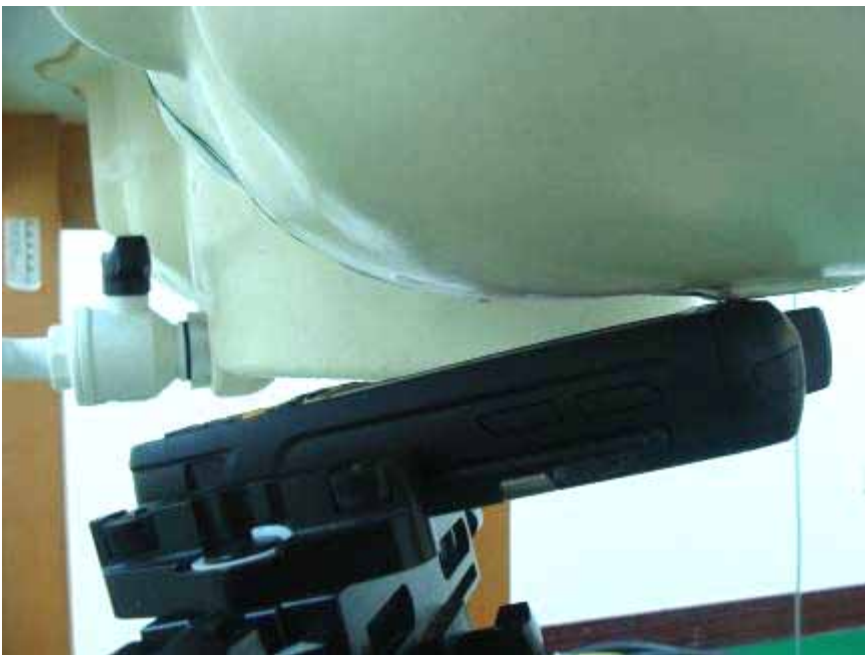
Left Tilted (Sample 1)