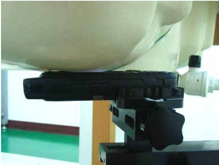
Right Cheek (Sample 2)