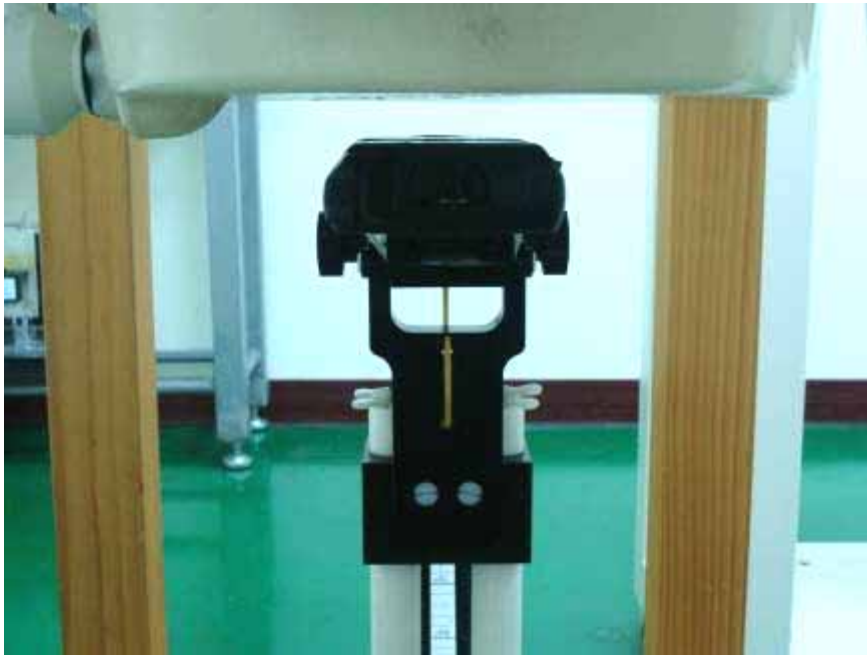
EUT Bottom with 1.5cm Gap (Sample 1)