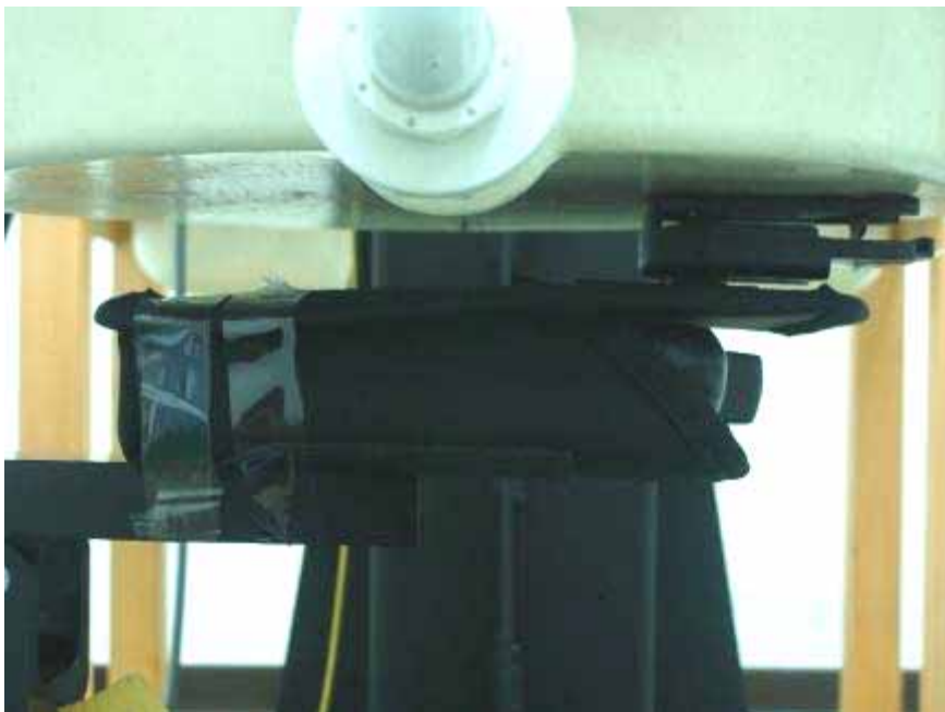
EUT Face with 0cm Gap (Sample 1 with Holster 1)