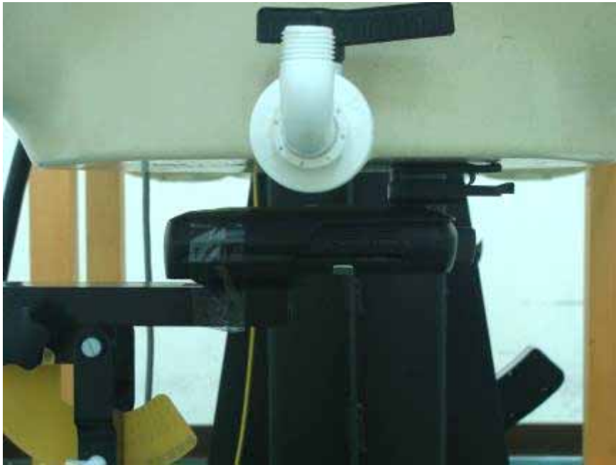
EUT Face with 0cm Gap (Sample 2 with Holster 2)