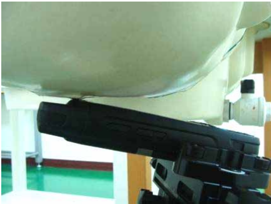
Right Tilted (Sample 1)