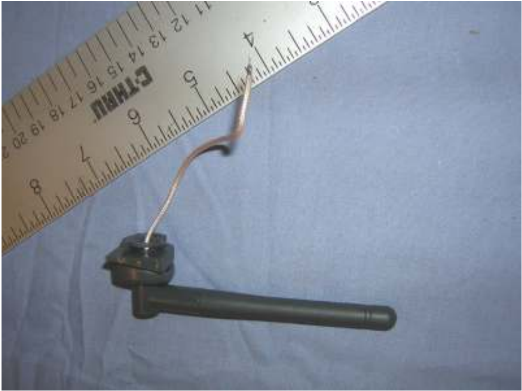
Antenna is attached to PCB through the piece of wire