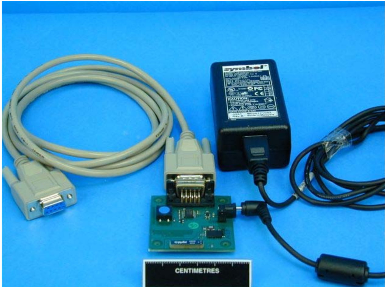
Front View including PSU