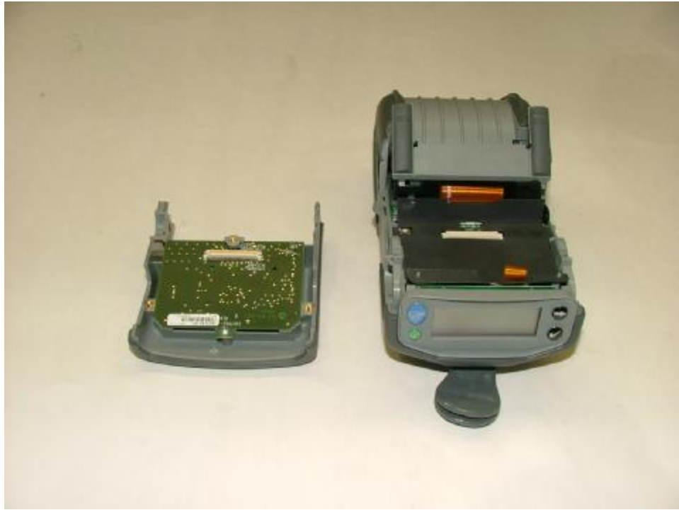
RF Carrier Board Removed