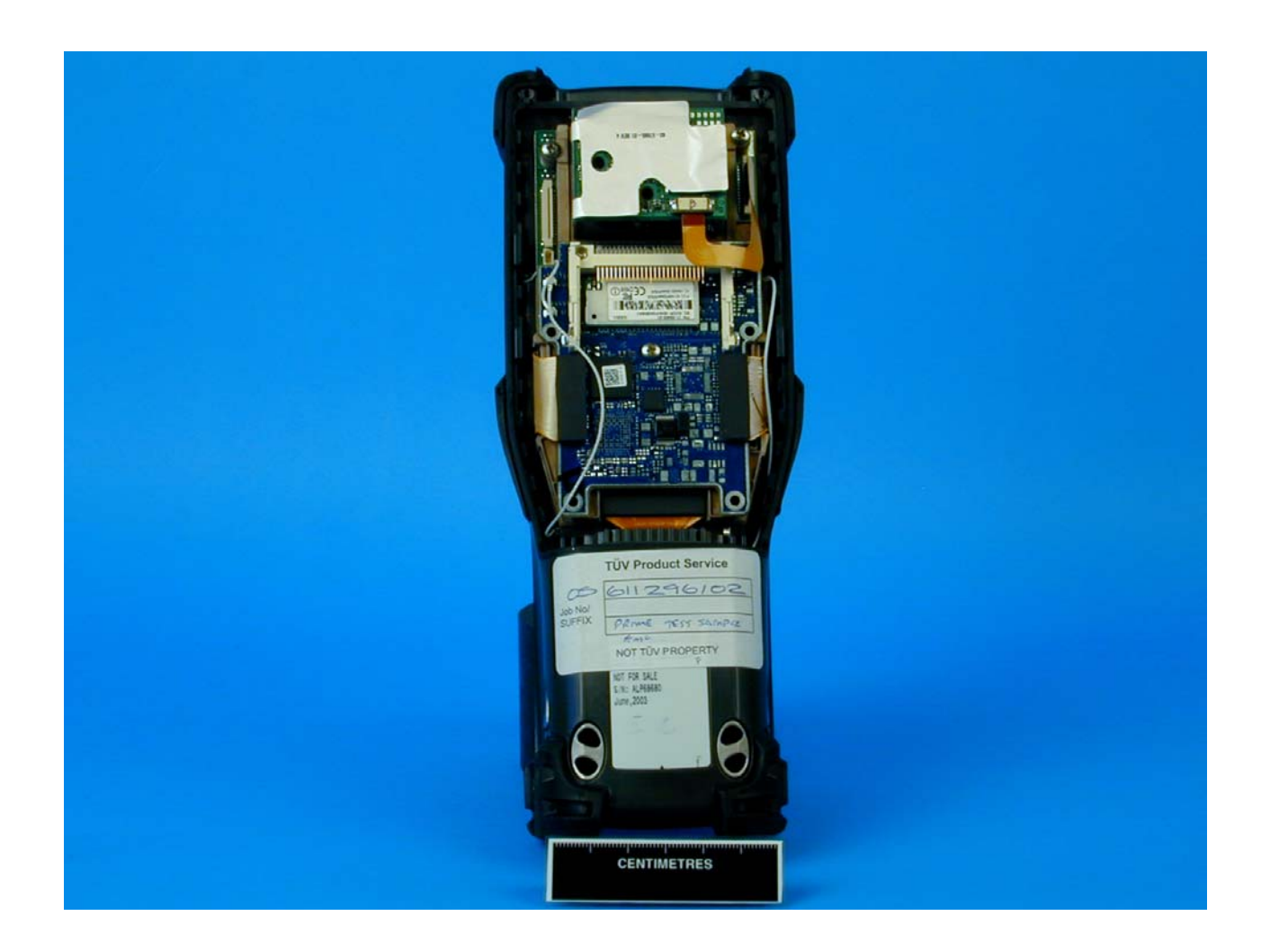
Photograph 6 MC9050 Internal view