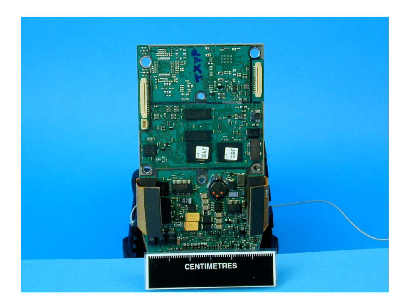
Photograph 11 MC9050 Internal view