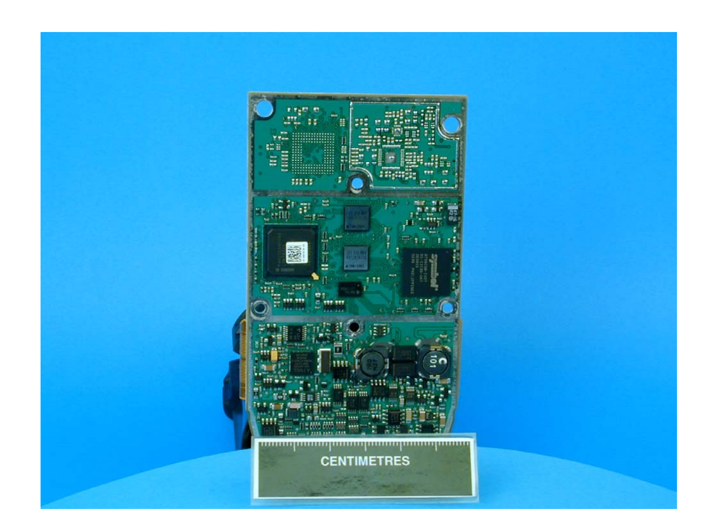
Photograph 10 MC9050 Internal View