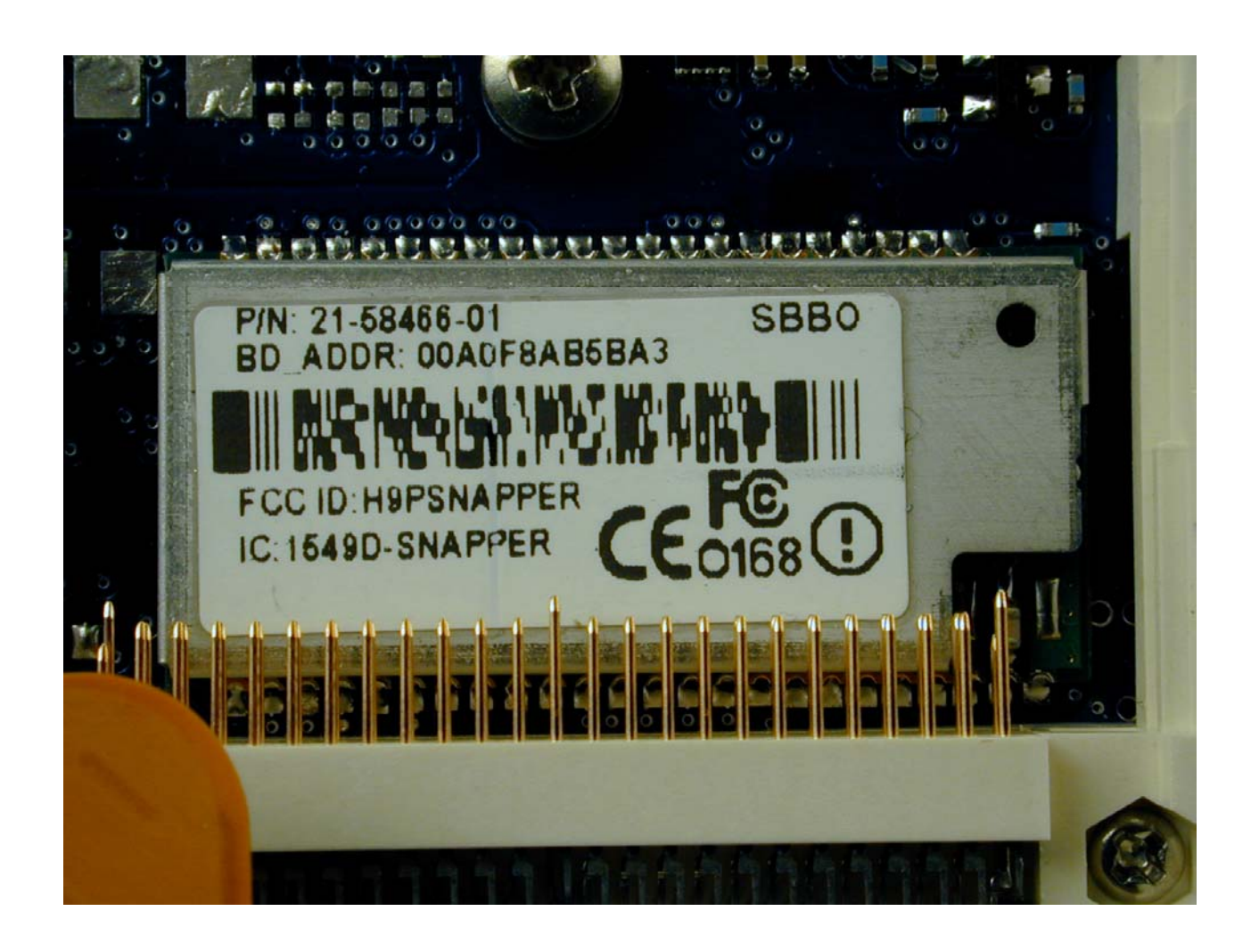
Photograph 13 MC9050 View Symbol 21-58466 Bluetooth Module