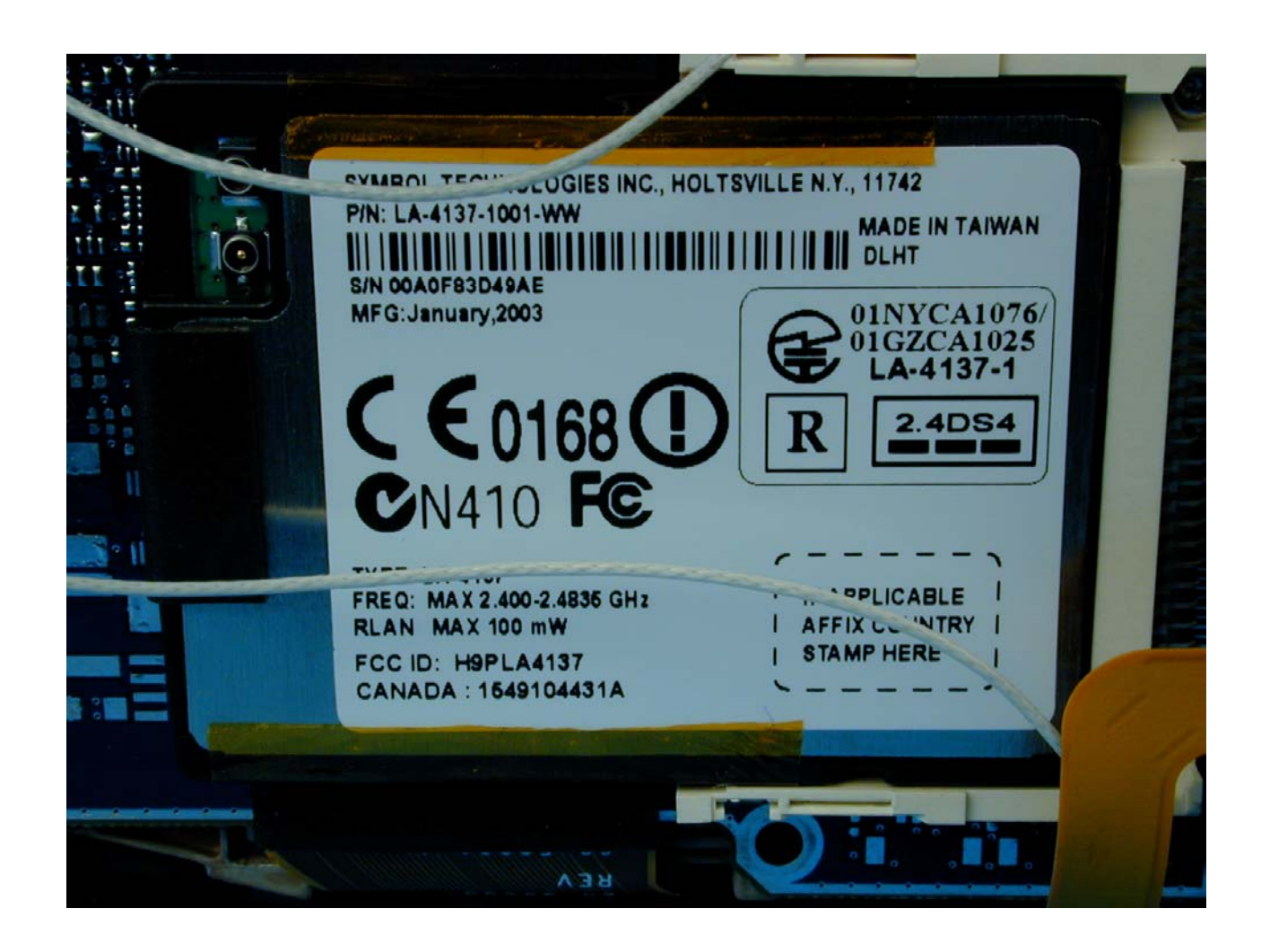
Photograph 12 MC9050 View of Symbol LA-4137 RLAN Compact Flash Card