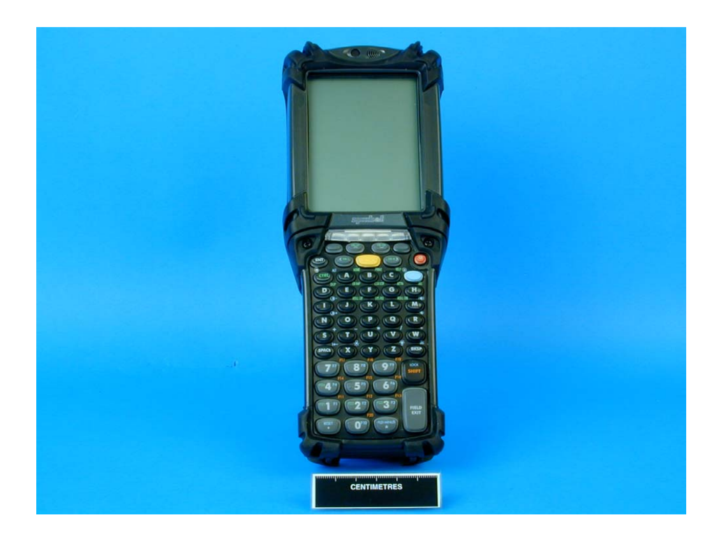
Photograph 2 MC9050 Front view