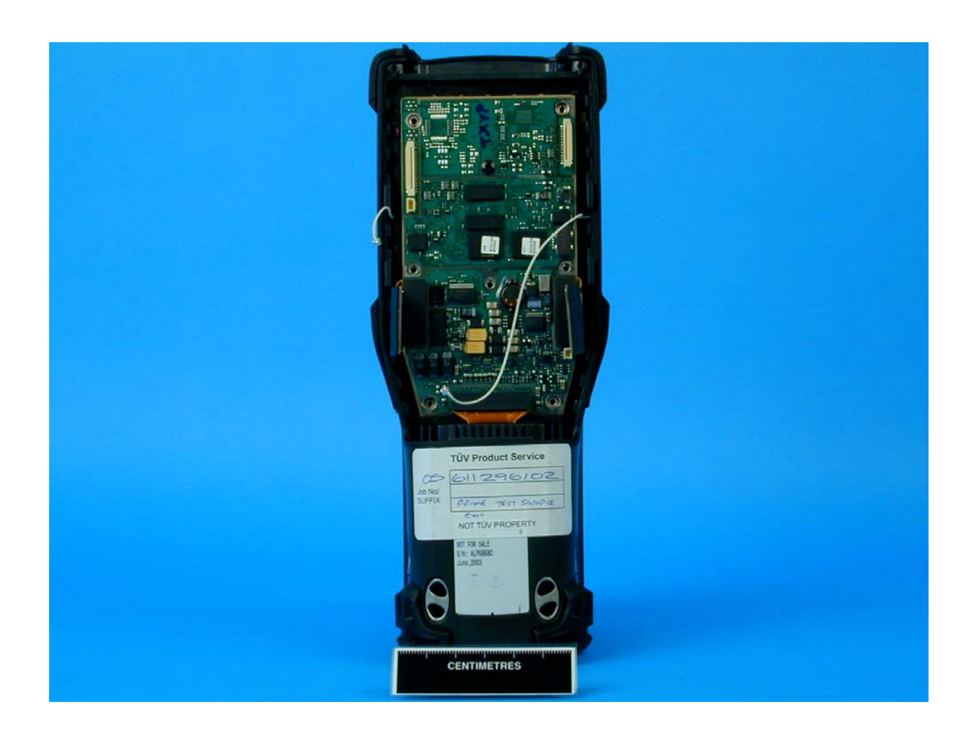
Photograph 9 MC9050 Internal View