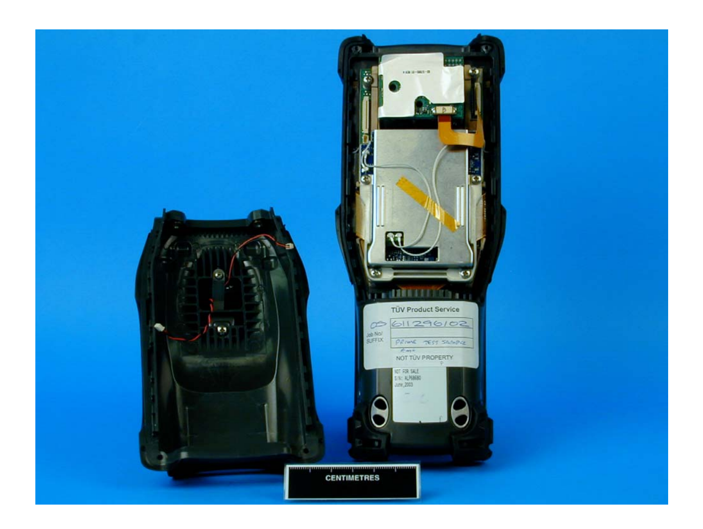
Photograph 5 MC9050 Internal View