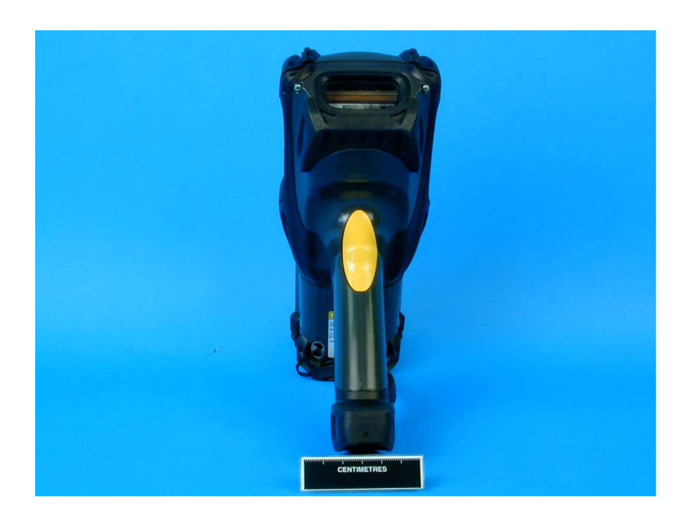
Photograph 3 MC9050 Rear View