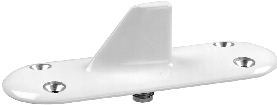
Figure 2.6 MAA-2000 Microwave Airborne Antenna

The Terminal LAN WLU-2001 operates with the MAA-2000 antenna. The MAA-2000 antenna is a streamlined blade utilizing a ground return feed system. It provides omnidirectional coverage in the horizontal plane with no nulls. All exposed surfaces and the base plate of the antenna are all-metal construction with a height of approximately 33 mm (not including connector). This design provides mechanical rigidity and grounding for lightning protection. The MAA antenna weighs approximately 0.1 kilograms (not including cable).