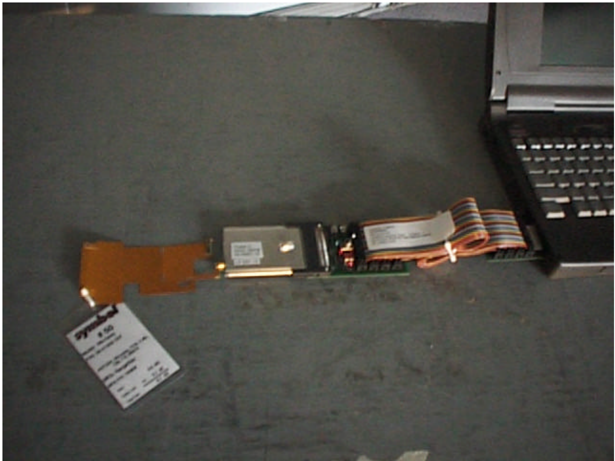
Radiated Emissions Setup Antenna Micropac