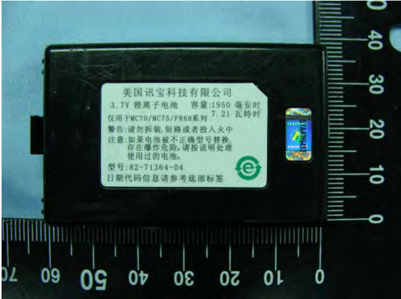
Model Name: FR6874