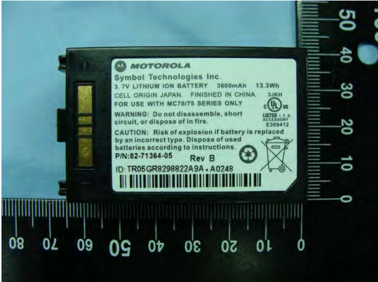
Model Name: FR6874