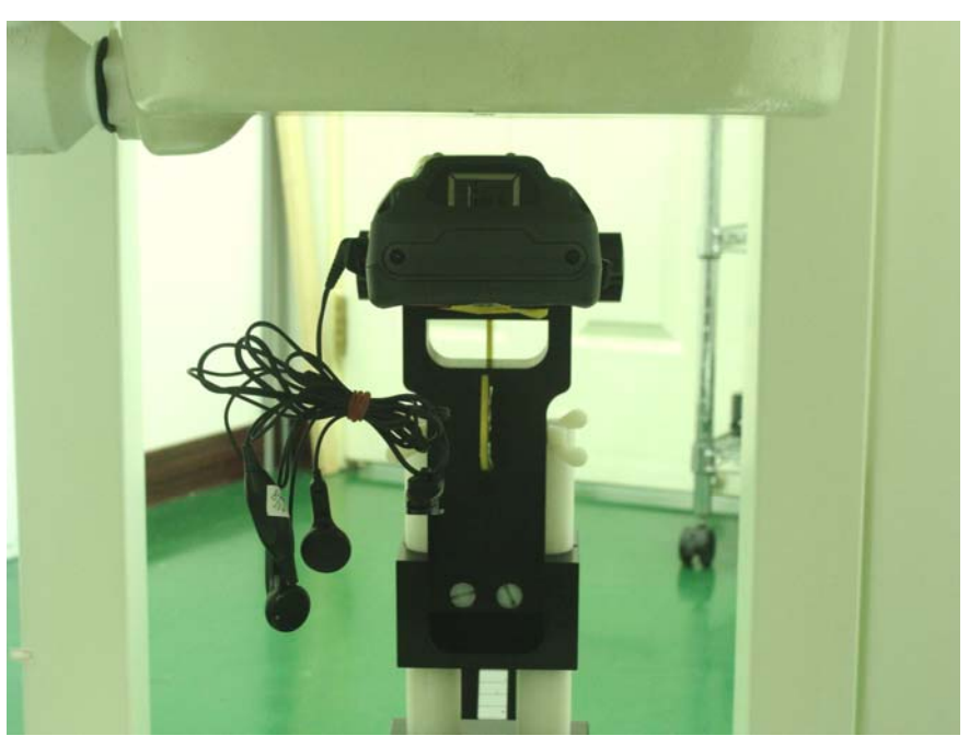
Bottom with 1.5cm Gap