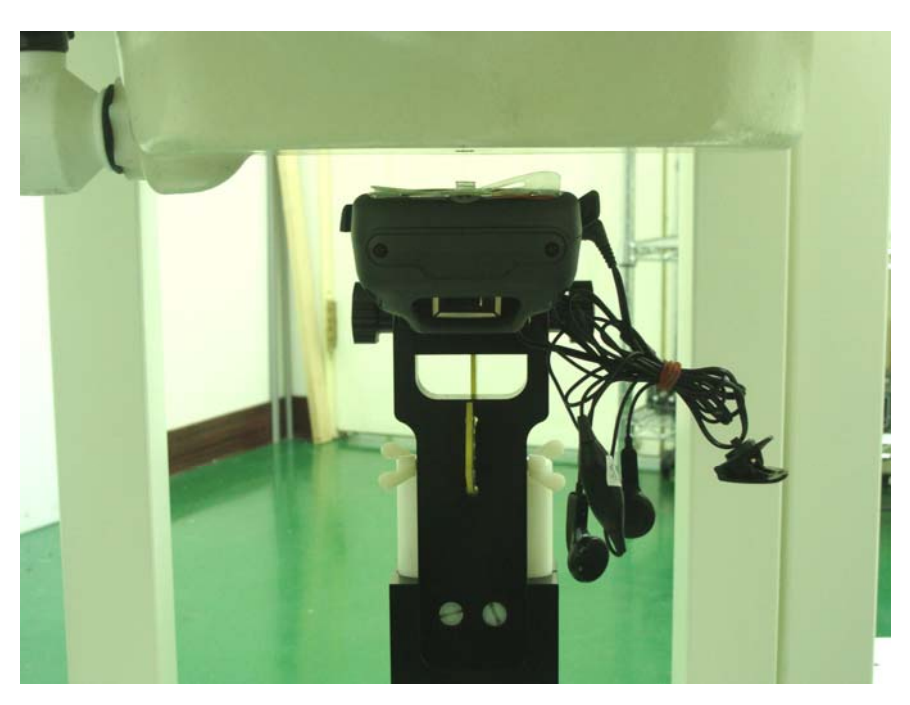
Face with 1.5cm Gap