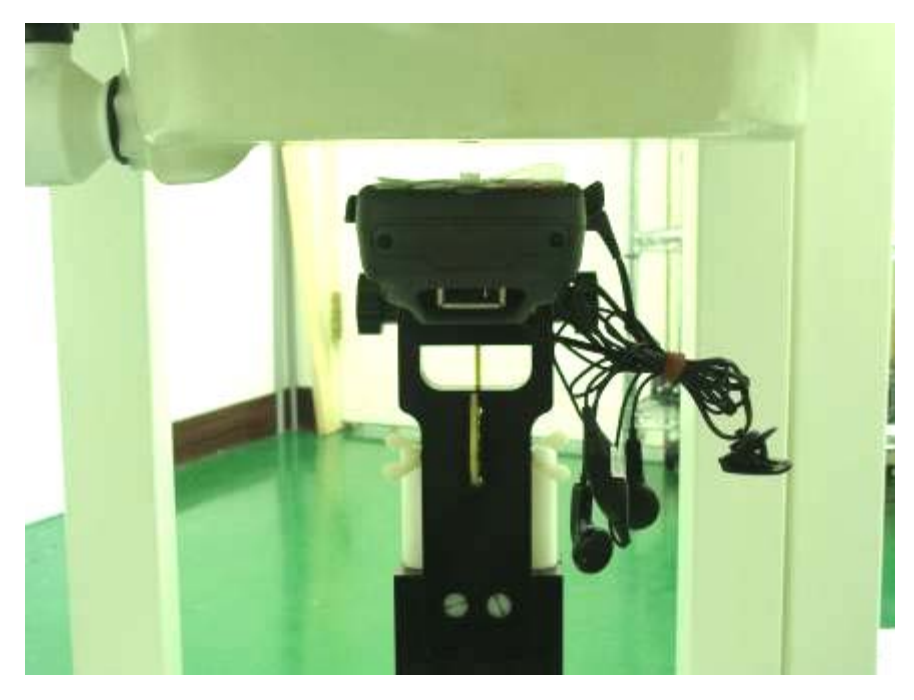
Face with 1.5cm Gap