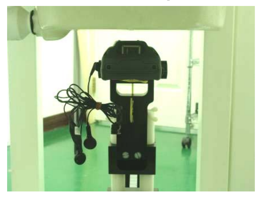
Bottom with 1.5cm Gap