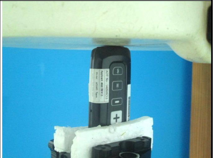
Bottom Side of EUT with 0 cm Gap