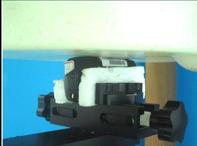
Left Side of EUT with 0 cm Gap