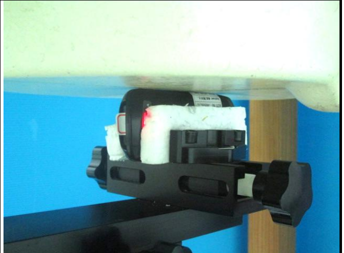
Right Side of EUT with 0 cm Gap