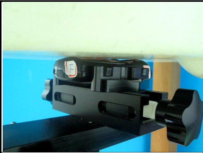
Front Face of EUT with 0 cm Gap