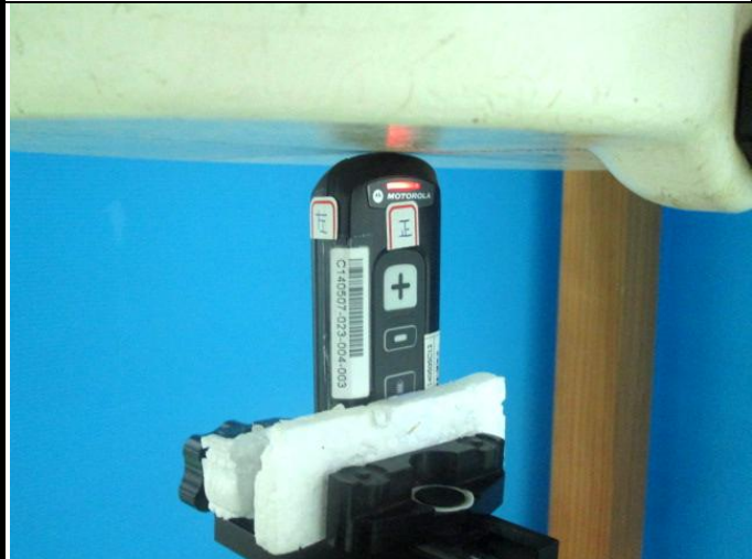
Top Side of EUT with 0 cm Gap