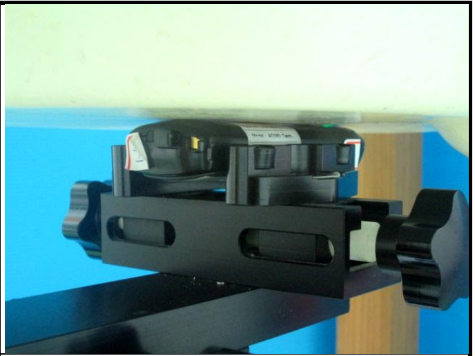
Rear Face of EUT with 0 cm Gap