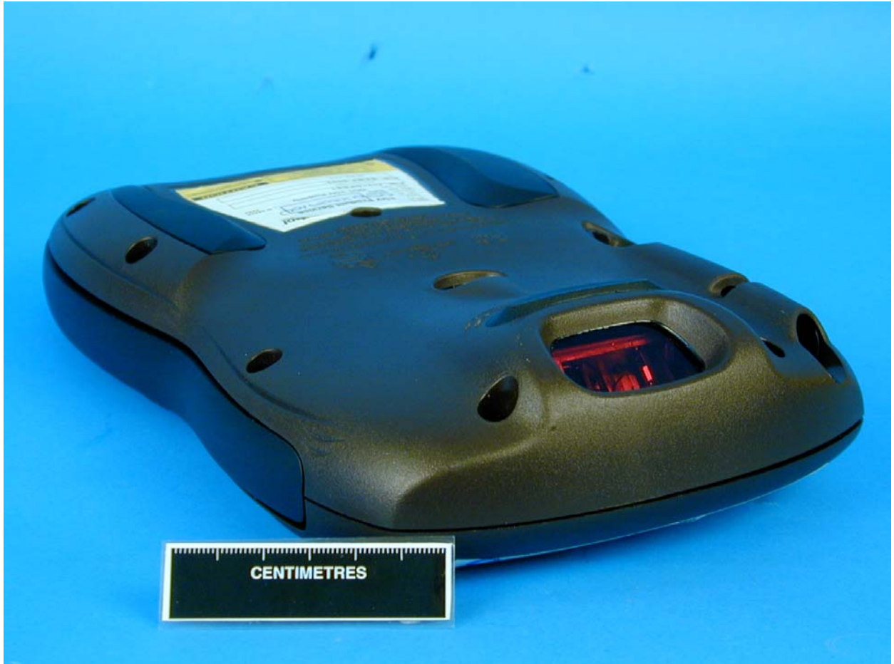
Right Hand Side View