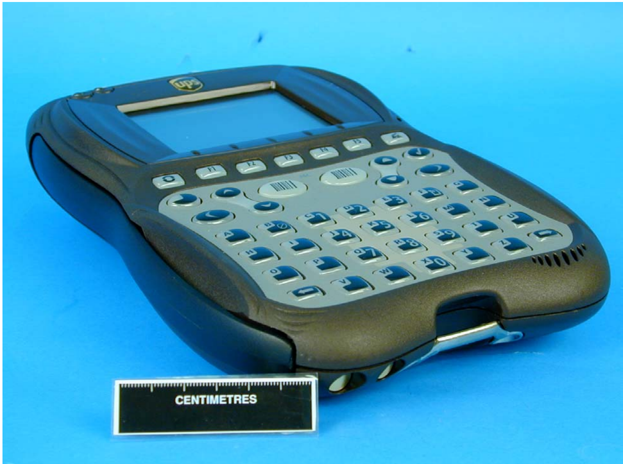
Left Hand Side View