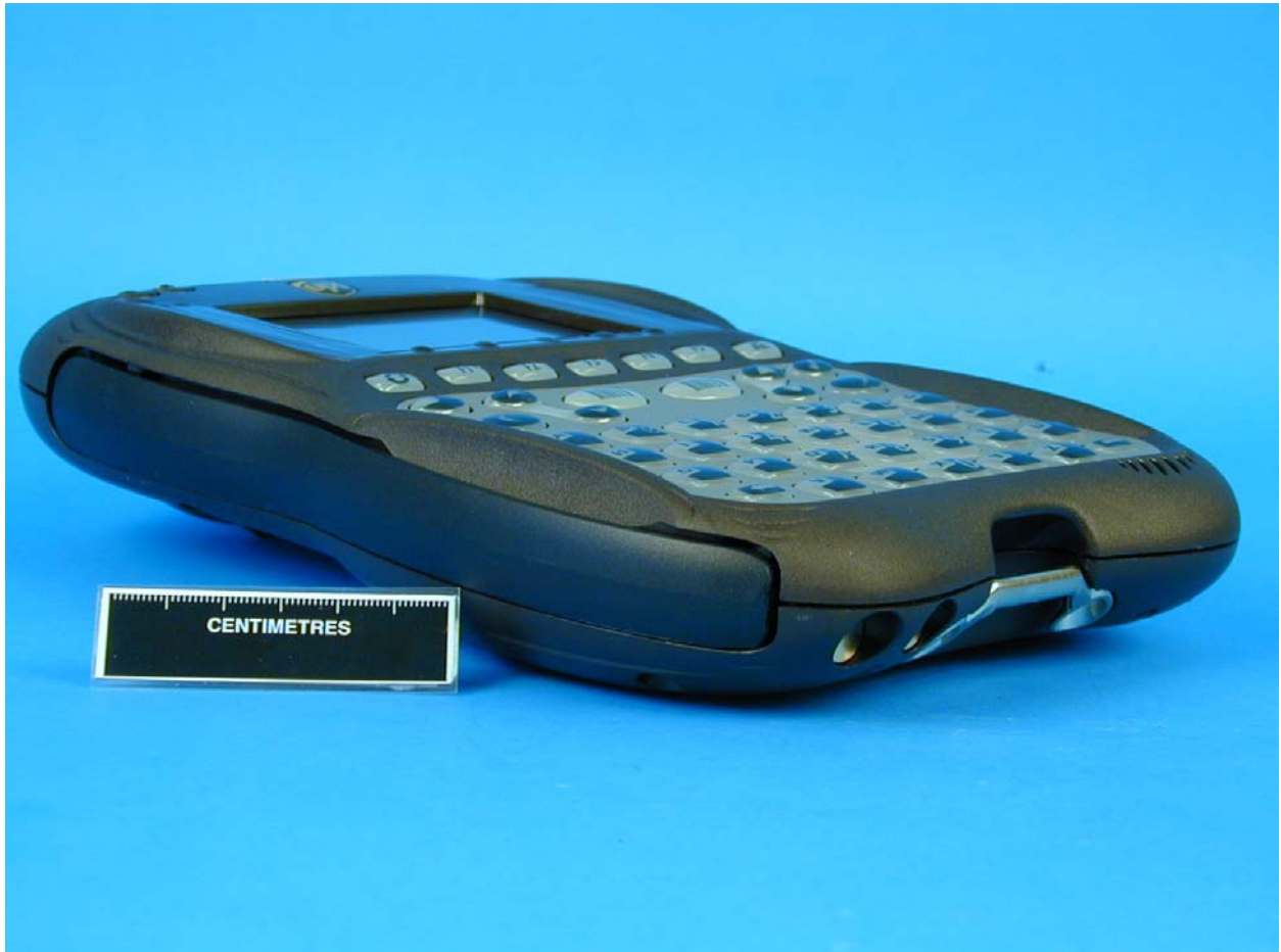
Left Hand Side View