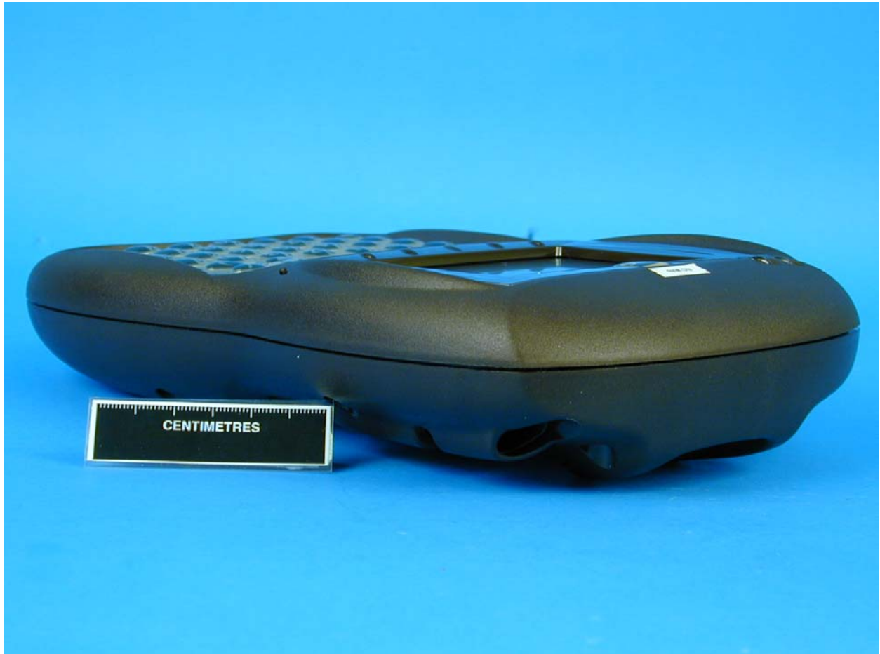
Right Hand Side View