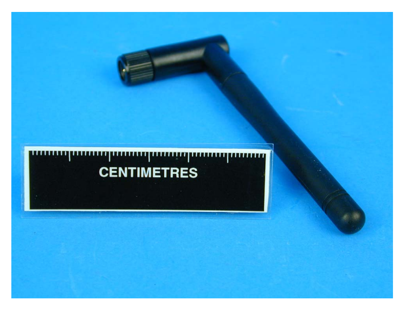
Test Antenna View