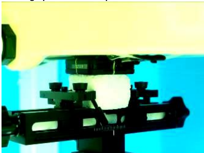
Rear Face of EUT with 0 mm Gap