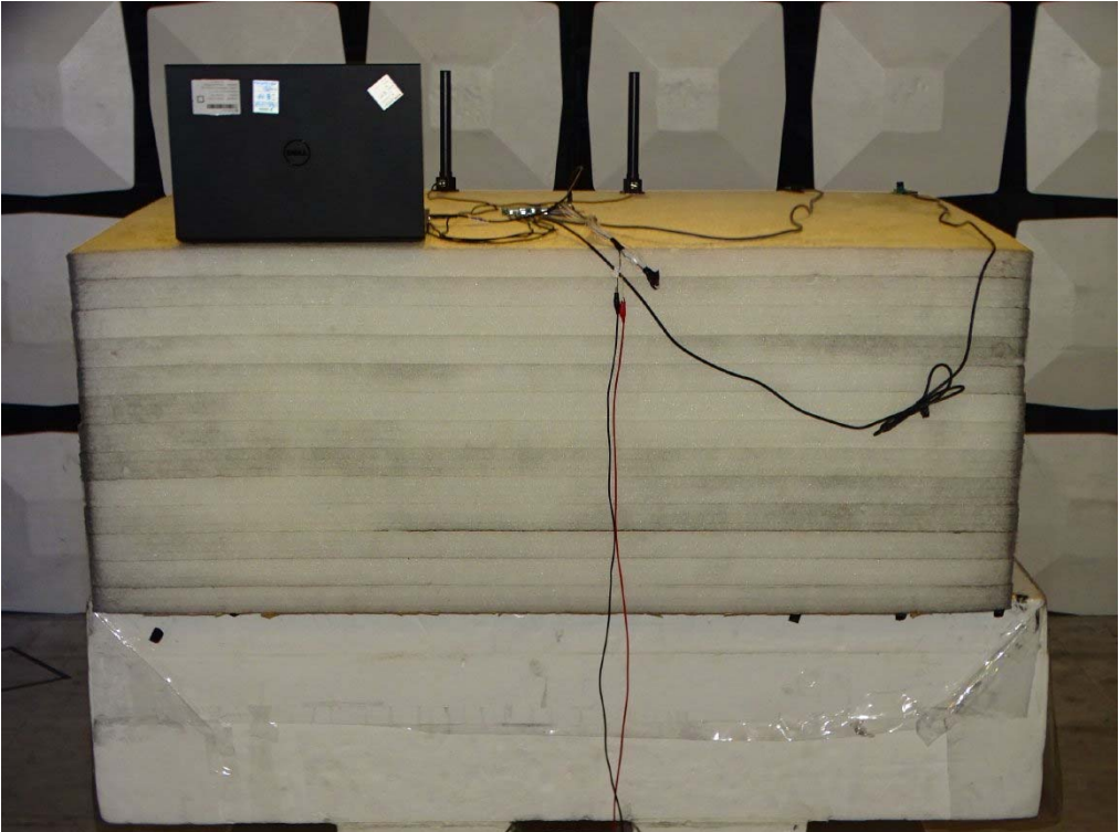
Back View of Radiated Test (Horn)