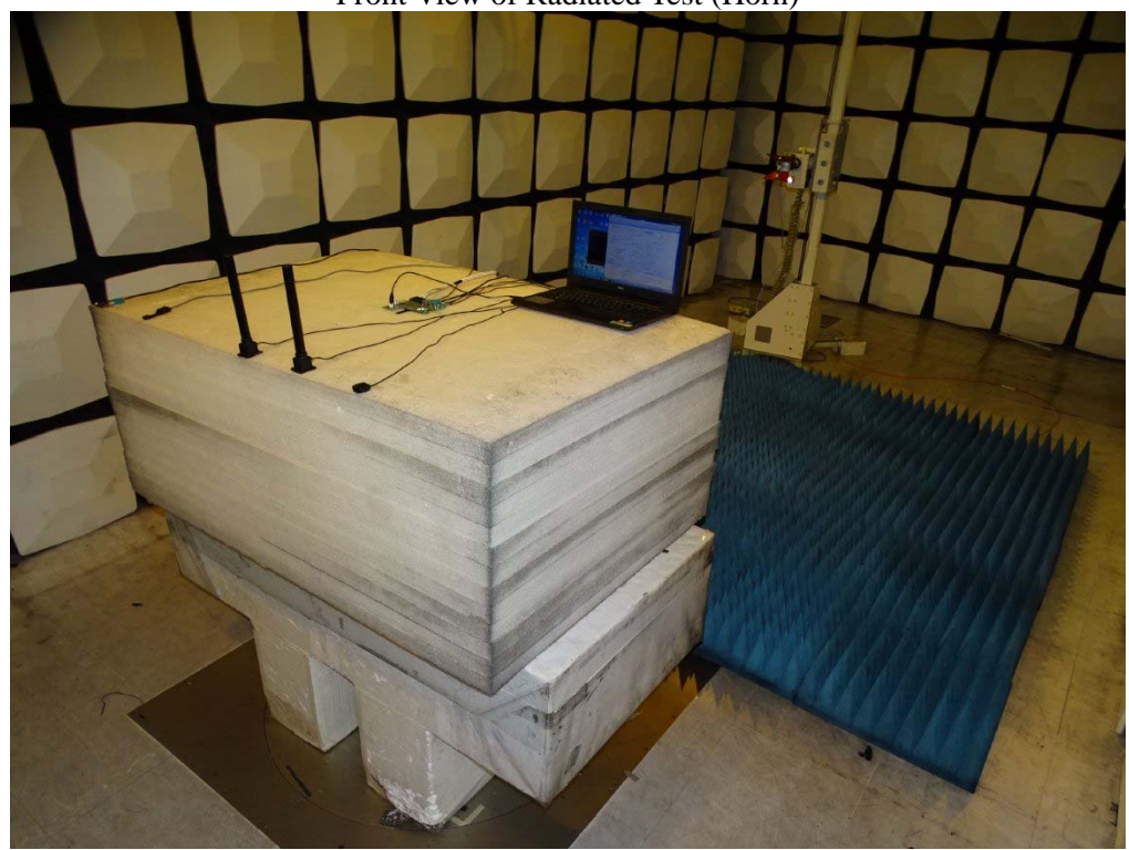
Front View of Radiated Test (Horn)