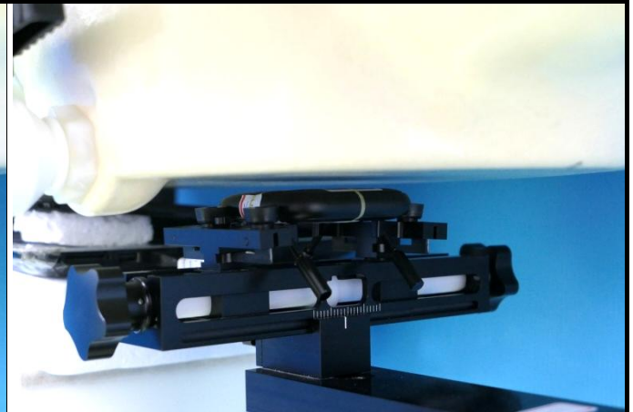
USB Horizontal Down at 5 mm