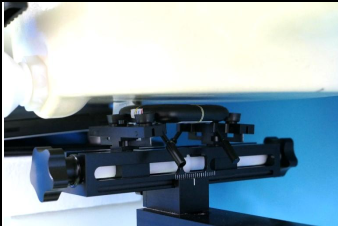
USB Horizontal Up at 5 mm