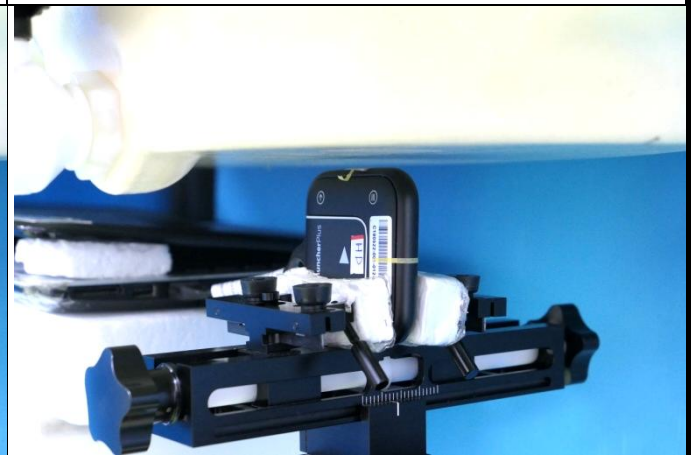
USB Vertical Back at 5 mm