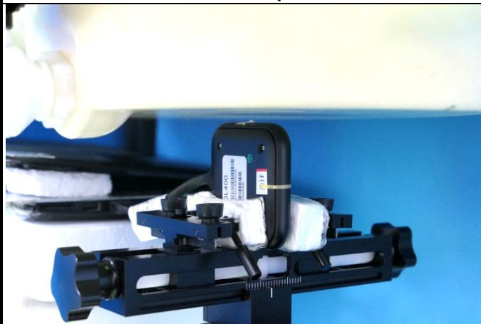
USB Vertical Front at 5 mm