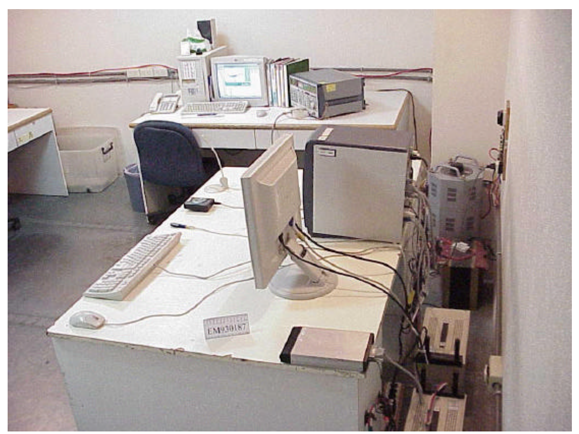
BACK VIEW OF CONDUCTED TEST