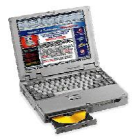
Figure 1 insert Installation CD

Step 2: Insert the Installation software CD into the CD-ROM of your machine.