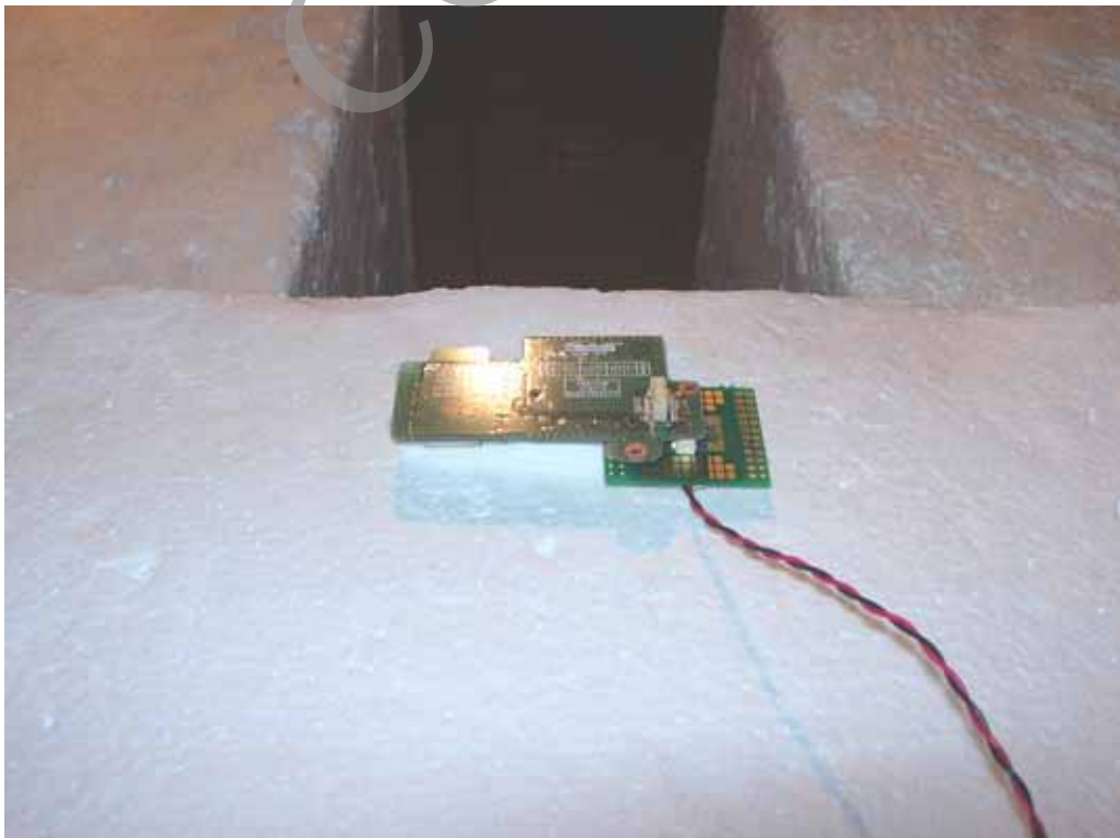
- Rear view (X axis) -