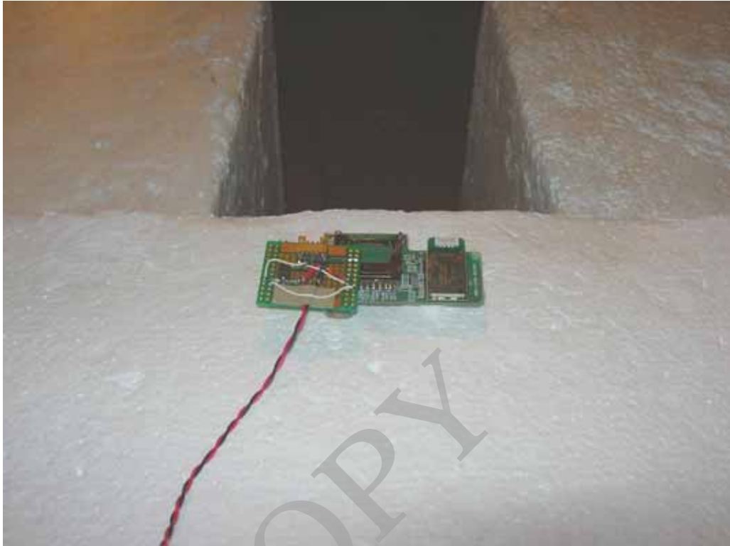
- Front view (X axis) -

Photograph present configuration with maximum emission