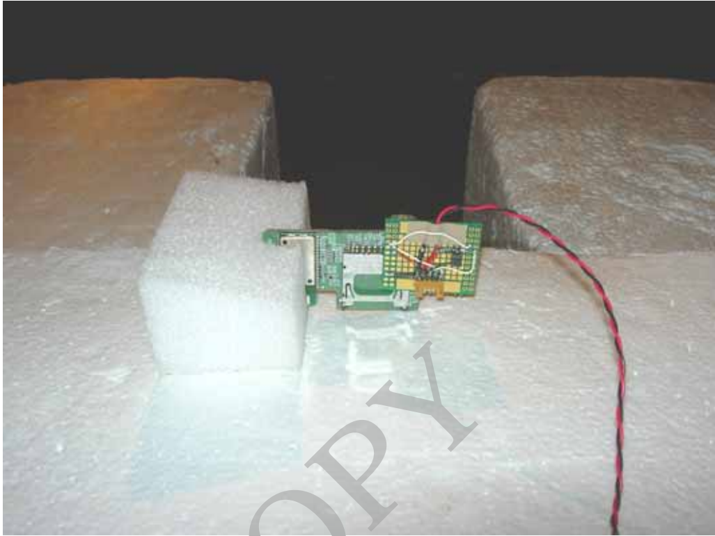
- Front view (Y axis) -

Photograph present configuration with maximum emission