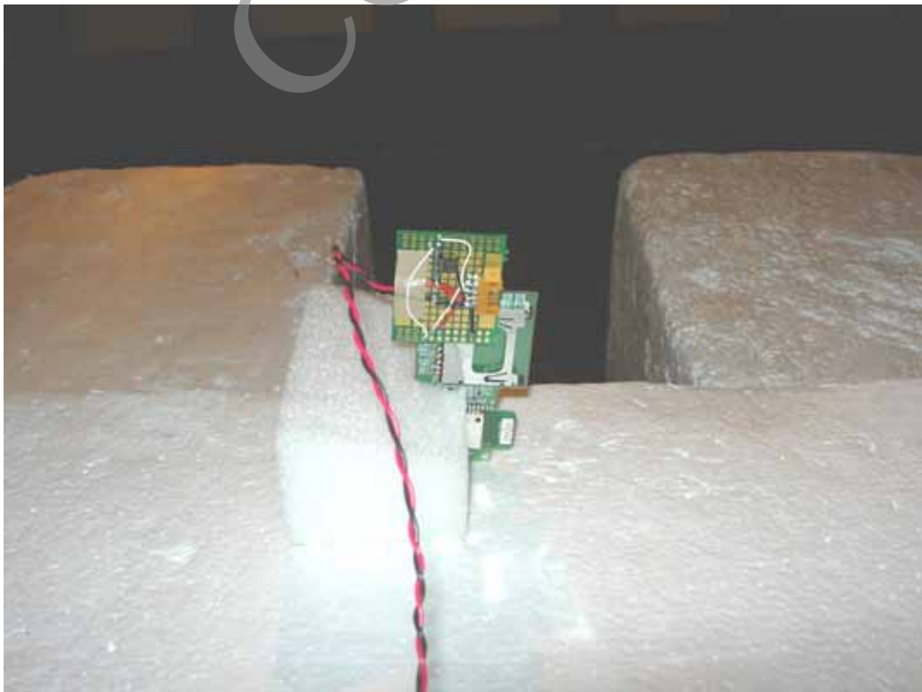
- Rear view (Z axis) -