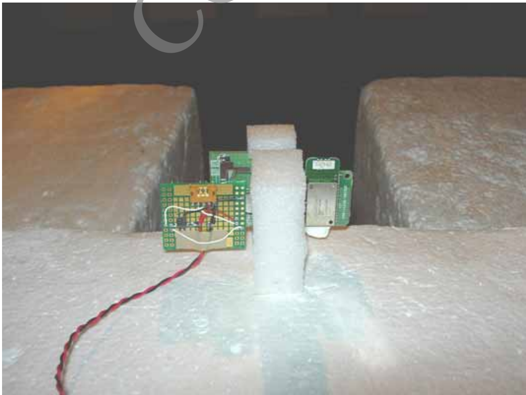
- Rear view (Y axis) -