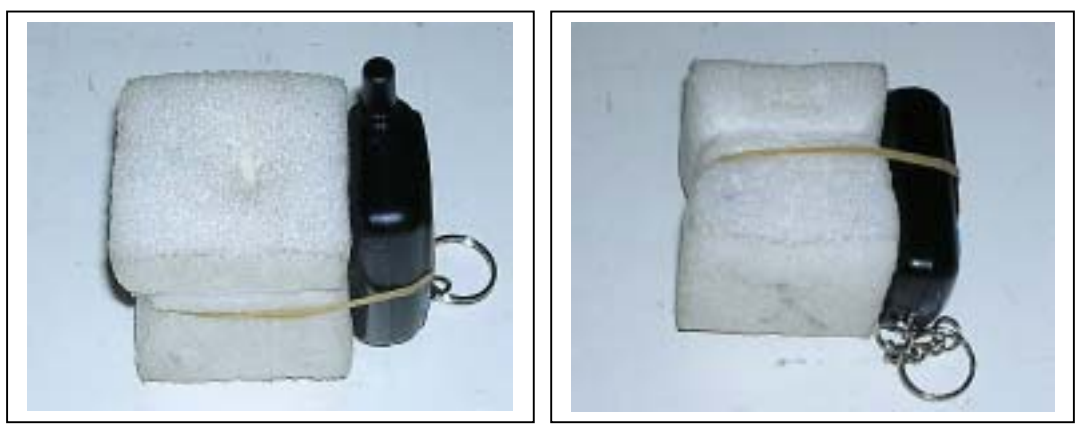
Radiated Open Site Test Set-up