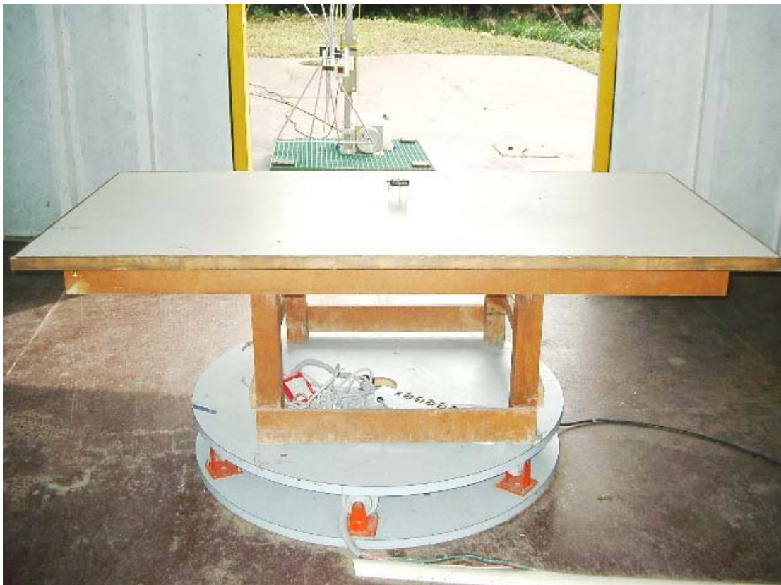
Radiated Open Site Test Set Up (Receiver Mode)