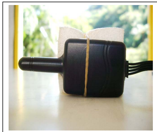
Radiated Open Site Test Set-up (Transmitter Mode)