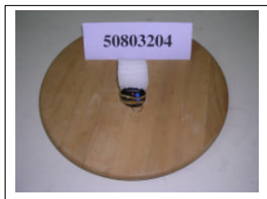
Radiated Open Site Test Set-up