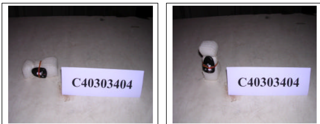
Radiated Open Site Test Set-up