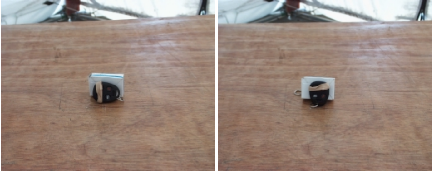
Radiated Open Site Test Set-up