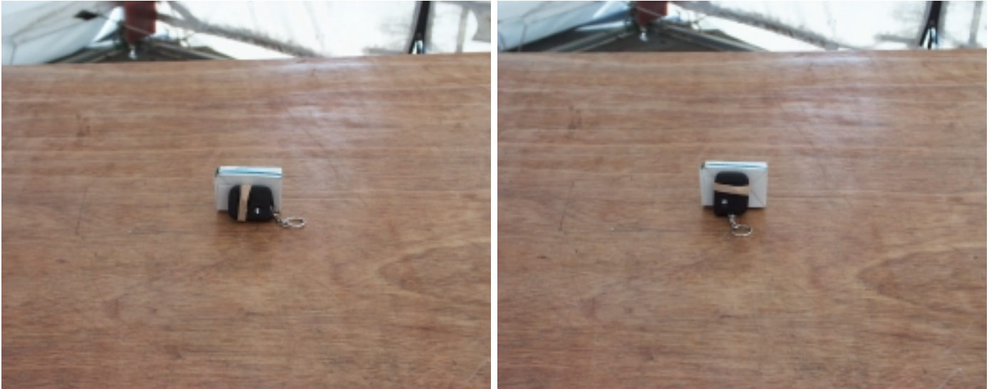
Radiated Open Site Test Set-up