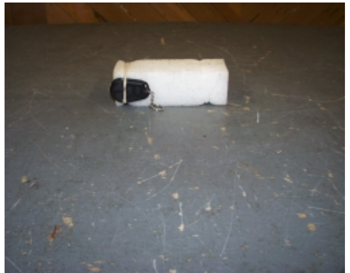
Radiated Open Site Test Set-up